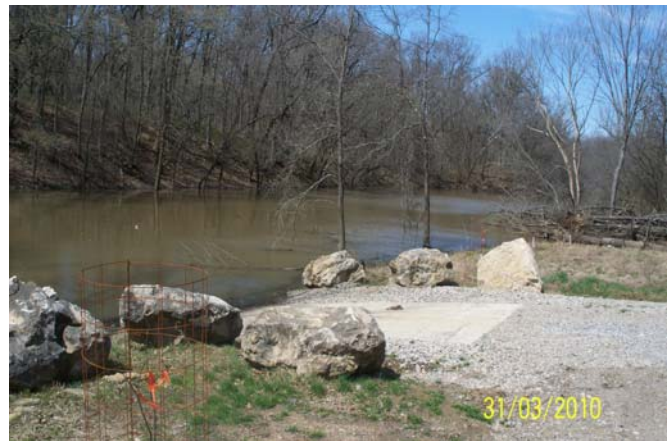
New two-acre lake and boat ramp in Mined Land Wildlife Area No. 6 that was funded by KDHE's Surface Mining Section.

In 2010, KDHE will initiate reclamation projects in Mined Land Wildlife Areas 12, 13, and 15. These areas are located two miles southeast of Scammon.