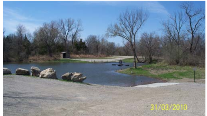
Mined Land Area No. 6, 2.2 miles west of 20 th St. and the bypass, is another popular fishing spot close to town.

In Girard, Crawford State Lake, Bone Creek Lake, and several Mined Land Wildlife Areas are close by. In Columbus, you have the VFW Lake, Empire Lake, Spring River, and again, more Mined Land Wildlife Areas