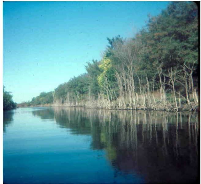
Raising water levels to flood shoreline timber creates great bass habitat on the Mined Land Wildlife Area.

Other options within an hour drive that are highly rated for big bass are Big Hill and LaCygne Reservoirs. Check out the 2010 Fishing Forecast on the KDWP web page, or pick up a printed copy at one of our offices to find the best of the best.