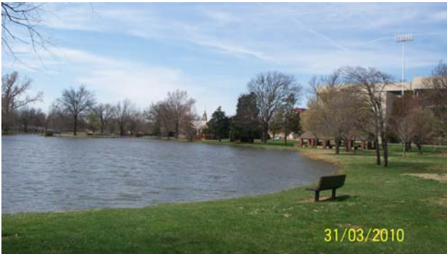
PSU Lake, just east of the football stadium, is one of many great places for a family fishing outing.

If you live in Pittsburg, PSU Lake is an outstanding place for a family fishing outing. Fish with a worm on a small hook placed a few feet below a bobber, and you'll soon be catching bluegill, green sunfish and channel catfish.