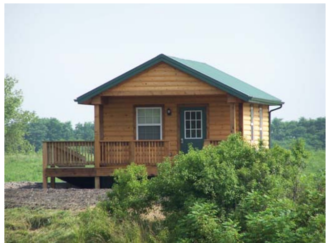
Cabin at trout lake in Mined Land Wildlife Area No. 30.

KDWP now offers more than 70 rental cabins statewide. In the Pittsburg district, Crawford State Lake has four cabins and the MLWA has one, with another becoming available this summer. These cabins feature the comforts of home while providing access to good fishing, hunting, and outdoor adventures.