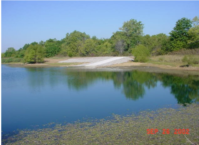
Boat ramp and improved shoreline angler access on the Mined Land Wildlife Area that was funded by KDHE's Surface Mining Section.

A million-dollar project was recently completed in Areas 1 and 6 of the MLWA. The interior roads within these rugged properties are needed to access remote fishing areas, but were not constructed with safety or long-term use in mind. They were just a necessity to get the coal out. The roads had degraded and posed significant safety hazards and maintenance problems.