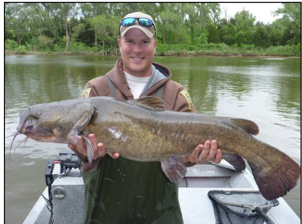
Big flatheads like this one are common in Cheney Lake as well as the Arkansas River.

Only flathead catfish may be taken, with legal hours ranging from sunrise to sunset. Anyone handfishing may not use hooks, snorkeling or scuba gear, or any man-made device other than a stringer, which may only be used after the fish is caught by hand and is above the surface of the water.