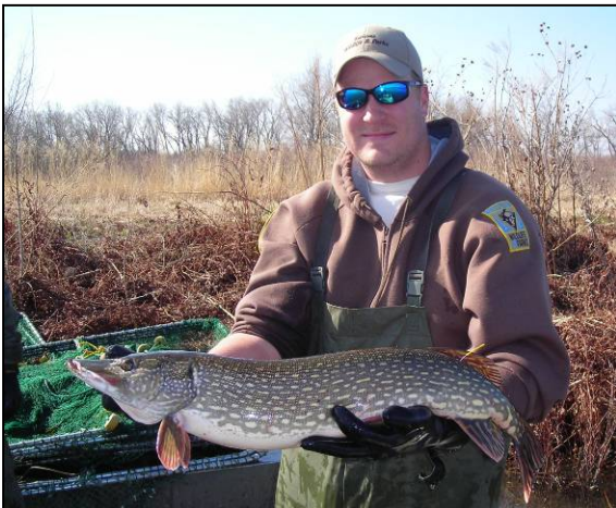
A northern pike caught and tagged at Kingman SFL this spring. Note the small yellow tag near the dorsal fin of the fish.

If you catch a tagged pike at Kingman, measure the fish if possible, and look closely at the small plastic tag placed behind the dorsal fin. Each tag will have a unique number as well as a phone number that you can use to report your catch. Reporting your catch will help KDWP manage and maximize this unique fishery.