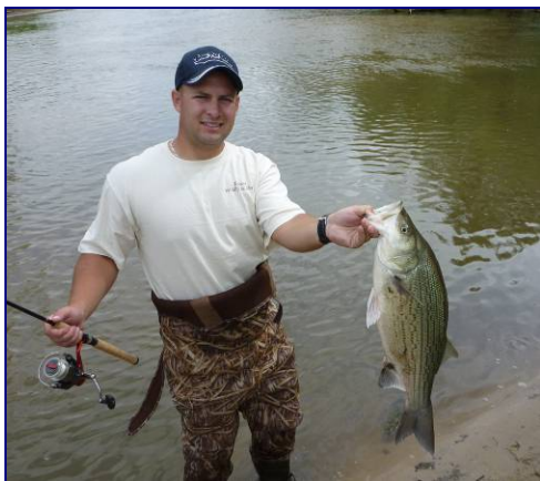
A 26-inch wiper caught in the Ninnescah River above Cheney Lake during late May.

During late March and April, walleye fishing off the dam at Cheney was hit and miss. Some anglers caught over a hundred walleyes over a period of a few days while others struck out due to inconsistent weather patterns and high winds. Walleye fishing is currently at its peak at Cheney as fish are being caught lakewide on points and flats from both boat and shore. In mid-summer, young-of-the-year gizzard shad and other forage fish will grow to sizes that can be utilized by walleyes and fishing will generally slow down a bit. Now is the time to get out and enjoy the high densities of walleyes that Cheney has to offer.