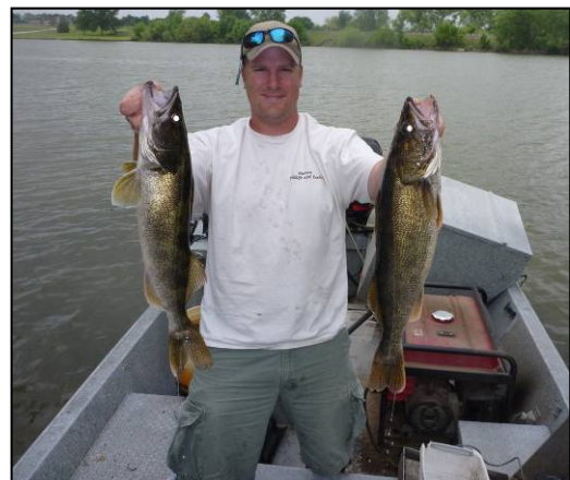
Wellington City Lake is one of the best saugeye lakes in Kansas.

Fishing has also been exciting at both Wellington City Lake and Wellington Hargis Creek Lake this spring. Last fall's netting results showed a tremendous crappie population at Hargis Creek that many anglers took advantage of this spring. Crappie to 14 inches were also caught at Wellington City Lake, where the wiper and saugeye fishing is currently excellent. Drifting drop-offs with live bait or fishing jig-and-crawlers in shallow water during the evening seem to be good tactics for saugeye at Wellington. Be sure to have a good hold on your rod though, as big wipers will take similar baits at any time! .....Continued on page 2