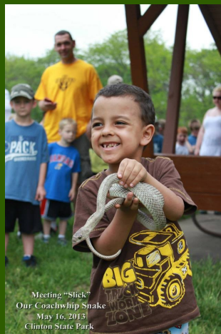
Meeting "Slick" Our Coachwhip Snake May 16, 2013 Clinton State Park