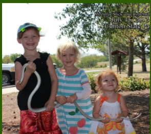
Successfully trained July 13, 2013 Clinton State Park