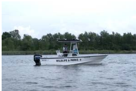
KDWPT lake patrols help to insure safe vessel operation on our public waters.

It won't be long before temperatures warm enough to encourage lake visitors to slip the boat in to enjoy a favorite pastime on the water. Whether fishing, swimming, cruising, paddling, skiing, tubing, or just relaxing, every vessel utilizing Kansas waters must have certain safety equipment on board. Do you have what you need to insure a safe and lawful visit to the lake this summer? Vessel owners should be familiar with regulations pertaining to equipment and education requirements. Does your vessel require a registration and decals, life jackets, fire extinguishers, sound producing device, navigation lights, skier down flag, wide angle mirror, muffler, or capacity plate? Do you have to have boater education? If you aren't sure, the KDWPT wants to help insure that your next trip is a safe and enjoyable one by providing boaters with access to a handy web page tool that can provide them with a list of requirements after they answer a series of questions about the vessel and the operator. Even veteran boaters may find the tool to be informative. The tool can be found at: http://ksoutdoors.com/Boating/Required-Equipment-Checklist . Additional boating information can also be found on the KDWPT website by visiting www.ksoutdoors.com and clicking on "Boating." Have a safe and enjoyable time on the water this summer!