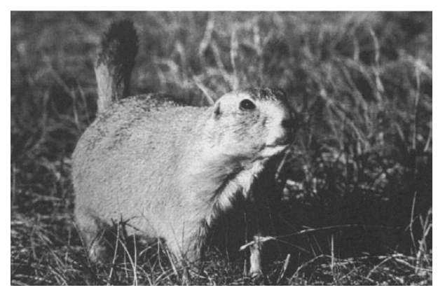
FIG. 1. Black-tailed prairie dog, Cynomys l. ludovicianus , in South Dakota. Note the long tail whose distal third is black. When involved in a territorial dispute as seen here, black-tailed prairie dogs flare the tail hairs and chatter their teeth.

Juvenile black-tailed prairie dogs, also called pups or young, are individuals that first emerged from the natal burrow <8 months prior to observation. Yearlings have been coming aboveground for \geq 8 months, but <20 months, prior to observation. Adults have been coming aboveground for \geq 20 months (Hoogland, 1995). Total