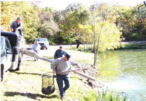
Trout stocking at Ft Scott's Gunn Park. During the trout season, 400 trout are stocked every two weeks. This two-acre pond has excellent shoreline angling access.

While some anglers are sitting in the house waiting for warm weather, others are taking advantage of the trout fishing at Gunn Park in Ft. Scott. This winter trout fishery is the result of the Wildlife & Park's Winter Fishing Opportunity (W.F.O.) program with the City of Ft Scott. Trout are stocked every two weeks from the start of the season, October 15, through April 15. Overall, trout fishing has been good this year, and the trout pond was frozen over only a few times this winter. The City operates an air cannon that mixes water from the bottom to the top, which decreases the likelihood of the pond freezing over, thereby allowing more days of fishing action. Older anglers and families with younger children have easy access to this pond as the area provides excellent shoreline fishing. After April 15, the water temperatures can reach the upper limits for trout survival, so stockings are stopped. The required yearly trout permit costs $12.50. Anglers 15 years of age and younger may trout fish without a trout permit, if they adhere to a two-fish-per-day limit.