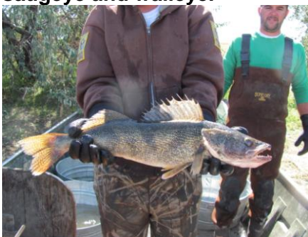
Sebelius 6.1 pound saugeye

SAUGEYE - Good. Catch rates will be pretty WALLEYE – Fair. good again this year and the opportunity for harvest will fair for saugeye and fair for walleye. The saugeye population is starting to come back with 8 to 15 inch fish accounting for 24 percent, fish 15 to 18 inches accounted for 62 percent and harvestable fish over 18 inches accounted for 14 percent of the 2012 fall sample. Sebelius still holds the current state record (9.81 lbs.) which was caught in November 1998. The density rating at Sebelius (14 inches and above) is 1st amongst all reservoirs in the state this year. The biggest saugeye sampled weighed 6.97 pounds. Four walleye were sampled in 2012, however, all of the fish were just under the 18 inch length limit. Look for these fish to be up by the Dam in March and April and then move to the flats in May, so get those jigs, crank bait's and night crawlers ready. An 18 inch length limit is in effect for saugeye and walleye.