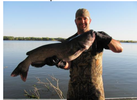
18.3 pound Sebelius channel cat

CHANNEL CATFISH – Good. According to FLATHEAD CATFISH – Good. 2012 netting results, the supply of channel catfish is good with 24 to 30 inch fish being particularly plentiful. Individuals in the 17 to 24 inch size range accounted for 33 percent and fish 24 inches and above accounted for 67 percent of the sample. The biggest channel catfish sampled weighed 8.07 pounds. Also, flathead numbers are on the rise and these big cats have become an important component of the catfish fishery. Individuals over 19 inches accounted for 100 percent of the fall sample. The biggest flathead sampled in 2012 weighted 3.08 pounds. These fish can be caught off the public fishing dock when they congregate around the fish feeder, around Leota cove, along the dam, up west by the Marsh Dike and around the Sandpit using shad sides and gizzards, night crawlers, stink bait or shrimp.