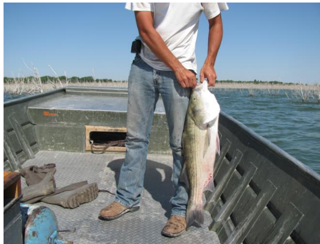
2012 Webster Wiper found floating in the water

WIPERS - Good. The supply should be good again this year. Fish in the 6 to 15 inch size range accounted for 46 percent and fish in 15 to 20 inch size range accounted for 42 percent. Larger fish (20 inches +) accounted for 12 percent of the sample, so hang on to those fishing rods. Webster's density rating (12 inches and above) is 5th amongst all reservoirs in the state this year. The biggest fish sampled in 2012 weighed 8.79 pounds. Surface action should be pretty good as these fish feed on shad, as well as, casting bucktail jigs into the wind around the corners of the Dam and lower portion of the reservoir.