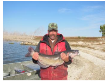
2012 Kirwin 23.37 pound Channel Catfish

CHANNEL CATFISH - Good. The overall supply of channel catfish is good as fish were scattered over a wide size range. The population is currently dominated by fish in the 16 to 24 inch size range. Individuals in the 9 to 12 inch size range accounted for 6 percent of the fall 2012 sample. Fish in the 12 to 16 inch size range accounted for 39 percent, fish in the 16 to 24 inch size range accounted for 45 percent and fish over 24 inches accounted for 9 percent. The biggest channel catfish sampled in 2012 weighed 23.37 pounds. The supply of flatheads is also good with 60 percent of the fish sampled being over 20 inches. The biggest flathead sampled in 2012 weighed 11.18 pounds. As the water starts warming up, these fish will be coming up shallow to feed, so fish the upper ends of coves and shallow areas using shad sides and gizzards. Also, the channels should be up in Bow Creek and the North Fork Solomon Rivers. These fish can be caught on rod and reel and/or setlines or trotlines using shad sides and gizzards, shrimp and stink or dip bait.