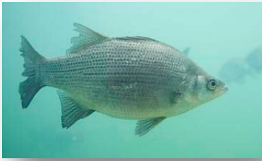
White Bass ( Morone chrysops )

The white bass is a freshwater fish in the temperate bass family Moronidae (mo-ron'-i-de). This family of fish has small scales and long, sharp spines on their fins, and includes striped bass, wipers and white perch.