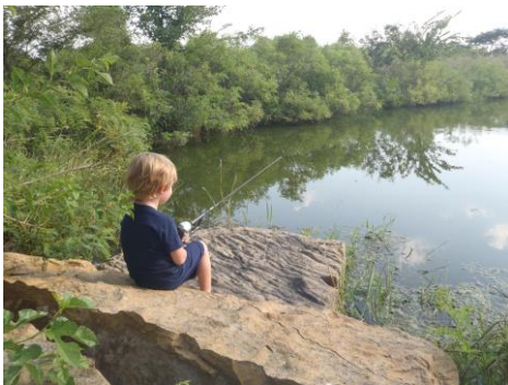
Kid Learning Patience!