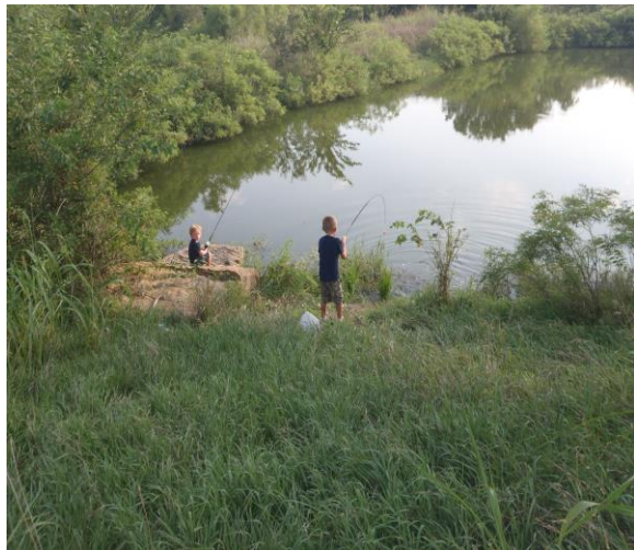
Young Anglers Fishing a Pond