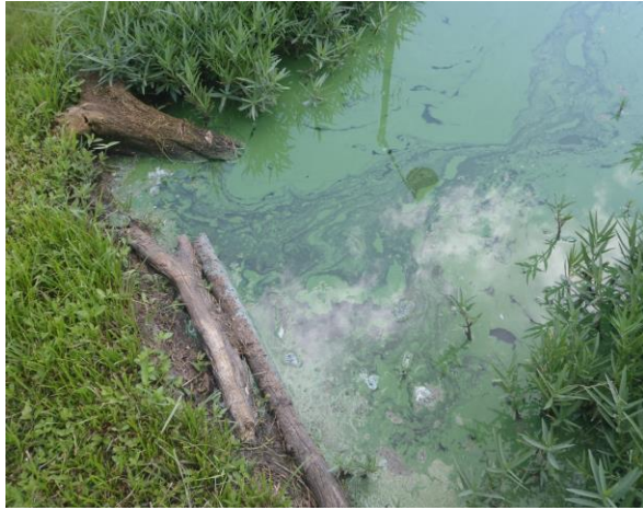
Blue-Green Algae Bloom