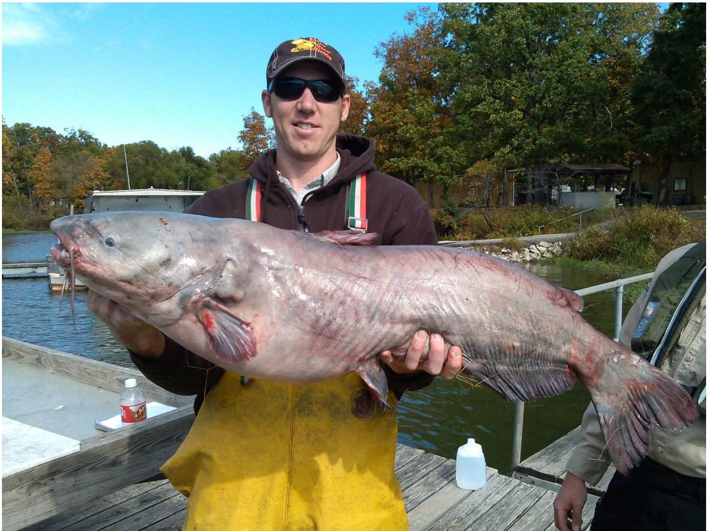
Fall test netting at La Cygne Reservoir – big blue catfish

Currently the walleye and blue catfish populations are low, but they are improving. Continued stocking should hopefully boost and improve both of these sought-after sport fish populations. Fall sampling efforts indicate that the stockings have been successful and are improving these developing populations.