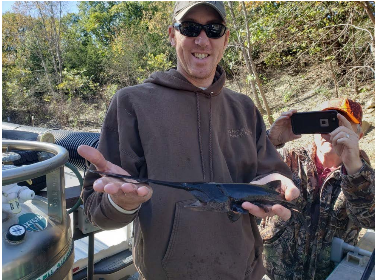
Here's a young paddlefish, fresh off the truck at Pomona Reservoir.

In 2019, there were Paddlefish stocked into Pomona Reservoir. This stocking at Pomona and in other nearby reservoirs will increase the downstream angling opportunities and maybe even in the main reservoir.