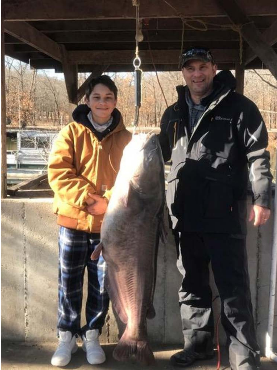
Here's a nice blue catfish caught recently at La Cygne Reservoir. Looks like a great place to go fishing.