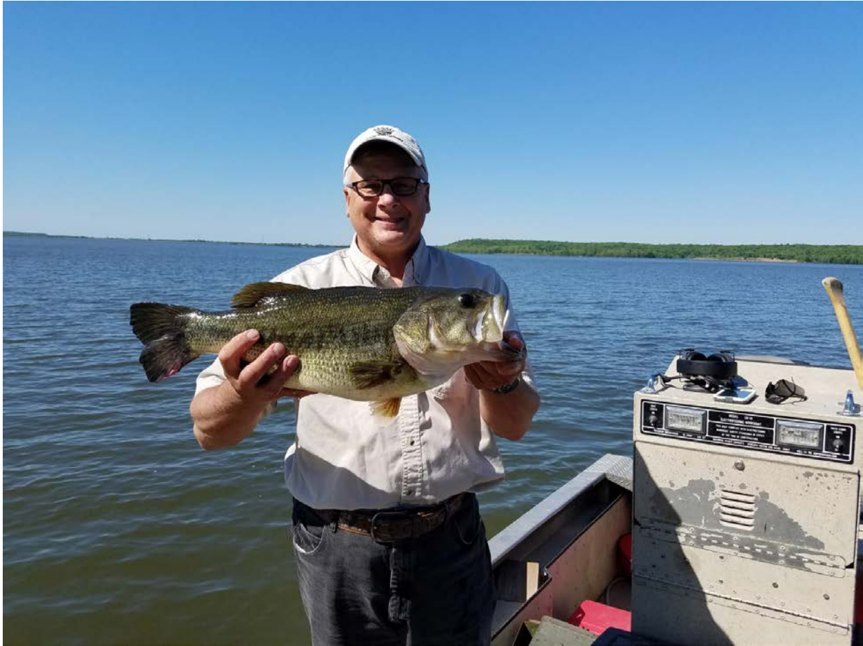
Beautiful La Cygne Reservoir, in Linn County, and fantastic Largemouth Bass fishing. Anglers have caught several bass over 10 pounds here at La Cygne. Because of its warm water it's a great place to fish in the colder months.