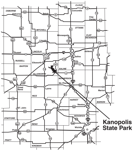
General Area Map

Equal opportunity to participate in and benefit from programs described herein is available to all individuals without regard to race, color, national origin, sex, age, disability, sexual orientation, gender identity, political affiliation, and military or veteran status. Complaints of discrimination should be sent to Office of the Secretary, Kansas Department of Wildlife, Parks and Tourism, 1020 S Kansas Ave., Topeka, KS 66612-1327. 08/11