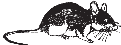
WHITE FOOTED MOUSE