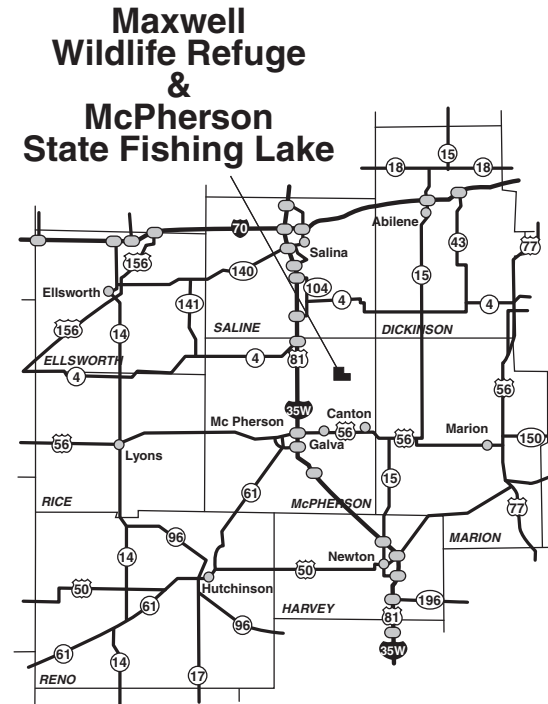
General Area Map

Consult area information signs for additional rules and regulations.