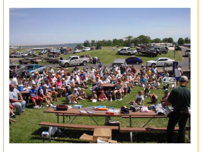
2010 youth tournament participants anxiously waiting the awarding of prizes.