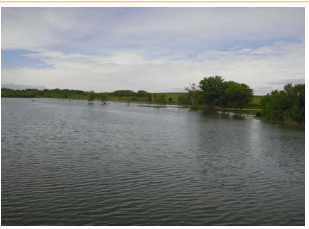
Views of Jewell State Fishing Lake from the boat ramp area when the lake was full in 2010.