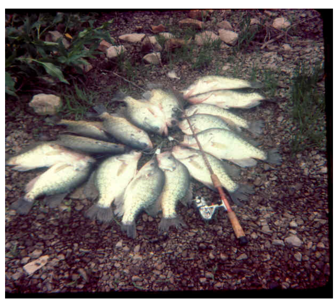
Stringers of crappie like this are possible in some of our local waters.

Crappie – The water temperature is already in the low to mid-60s, and crappie are moving in shallow to spawn. It's time to get after it. The highest density population of 8-inch and larger crappie was found at Neosho State Fishing Lake. The October frame-net catch was 70 fish/net. Although numbers are high, you'll have to sort through a lot of smaller fish for a good mess to eat. Only 6 percent of the catch was over 10 inches. Crawford State Fishing Lake and Chanute City Lake also have high numbers of smaller fish, with some larger fish mixed in. Bone Creek and some of the larger lakes on the Mined Land Wildlife Area have more quality-size fish to offer. Bone Creek frame-net catch rates are low due to the very clear water, but last year anglers commonly reported catching crappie 12 inches and larger. Nearby Bourbon County Lake (Hiattville) and Big Hill Reservoir have good crappie populations too, and would be good places to wet a line and have a good chance for some larger fish.