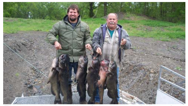
These trophy channel catfish were caught in a private strip pit in Crawford County on April 27, 2011. They ranged in size from 19 to 23 pounds. Live green sunfish were used as bait.

Channel Catfish - Channel catfish anglers are fortunate. Even though channel catfish don't reproduce and maintain their numbers in small lakes on their own, KDWP hatcheries produce plenty. In 2010 over 33,500 intermediates (8-12 inches) were stocked in the Pittsburg district. Catfish are plentiful in all our public waters. Neosho State Fishing Lake, Crawford State Fishing Lake, and Bone Creek Lake ranked the highest based on samplings last October. The MLWA also has a lot to offer, as each fall 14,000 fish are stocked throughout hundreds of pits. As seen in the photo below, and the fact that the state record 36-pound channel cat was caught in the MLWA, strip-mined lakes are capable of producing big fish. If you like river fishing and the opportunity to set limblines or trot-lines, the Neosho River and Spring River-Empire Lake complex offer some good fishing. Another good bet, and ranking excellent in the Fishing Forecast, is nearby Bourbon County Lake at Hiattville.