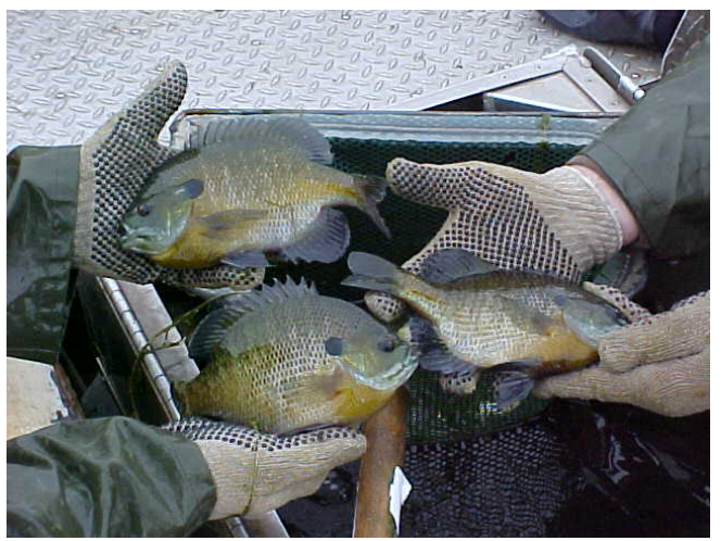
Colorful male bluegill will soon be building nests in shallow water where they can be easily located.

Blue/Redear - Bluegill and redear are common in most all of our lakes. Put a worm on a small hook a few feet below a bobber, and fish along weed lines, and you will probably be successful. Bluegill and redear are members of the family Centrarchidae, or nest builders. They move into shallow water where the male builds a plate-size nest he tends until the eggs hatch. The clearer the water, the deeper they nest. In strip-mined lakes, where shallow water is often restricted to the ends of larger lakes, spawning fish are not hard to find. Spawning areas are at a premium, and all the sunfish are forced to use the few suitable areas. The result is that hybridization is common, and you will often see hybrids of bluegill, redear, green sunfish, longear sunfish, and others. 2010 nettings showed Neosho State Fishing Lake and Bone Creek Lake have the best sunfish fishing. The MLWA is also offers great opportunities.