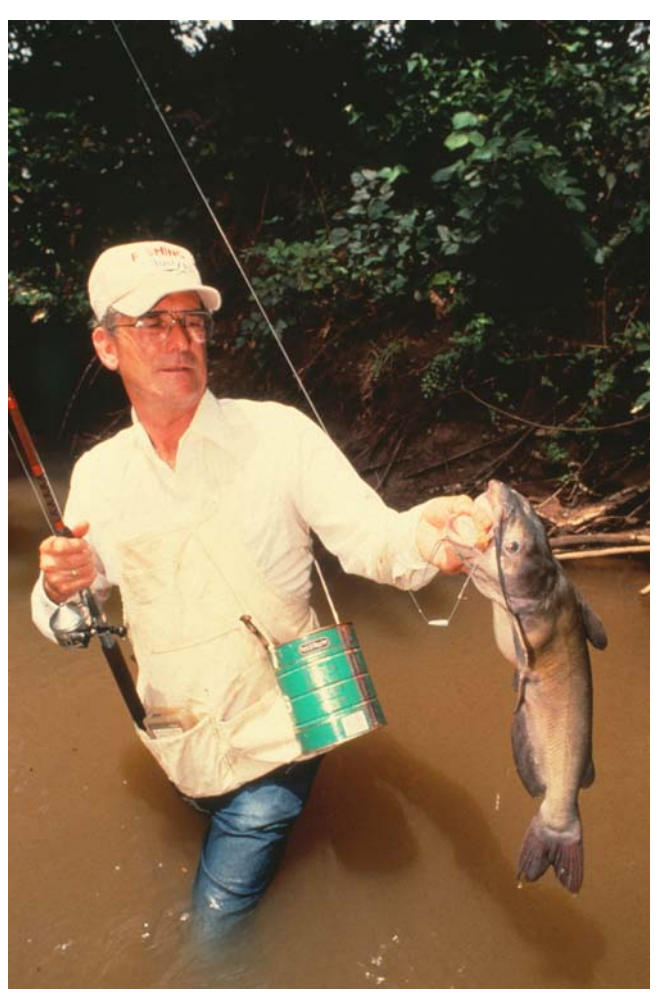
Large catchable-size channel catfish will be stocked in public lakes in the Spring River drainage when funds are received from the Orval Kent settlement.

Orval Kent Food Company, Inc., headquartered in Wheeling, Ill., must also spend at least $32,500 on a project to re-stock fish in or near the watershed of the Spring River.