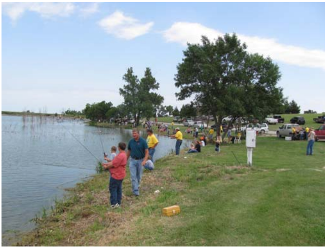
Kids fishing at the Logan City Lake clinic

Aquatic education is a big part of our summer schedule. We participated in four aquatic education events this summer with just under 300 kids participating. These events were held at Webster and Keith Sebelius reservoirs, Webster stilling basin and Logan City Lake. A big thank you goes out to the various sponsors of these events. Whether the donation of worms, minnows, fishing poles or just a little bit of your time, contributions were greatly appreciated and thoroughly enjoyed by the kids.