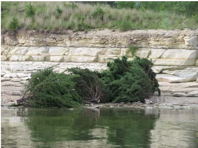
Cedar trees staged to be sank

This summer has been busy with habitat work at Webster and Keith Sebelius reservoirs. This work takes a lot of coordination with the public land and park managers to get the cedar trees and equipment lined out. Then we have to make sure we have weights to sink the cedar trees. We had a lot of help from the inmate crews out of Stockton and Norton to get the weights made and also getting the trees on our habitat barge so that we could take them out and sink them. Our weights are molded in a five gallon bucket with the bottom cut out of it and then filled about two-thirds full of concrete. Our handles for the weights are made from 4-foot fence stays that are twisted up tighter using a drill and vise. We then have to cut them in half and bend them into a handle that looks like this . These handles are then inserted into the bucket of cement and then the form/bucket is then slid off the cement and on to the next weight. Once all the weights are made and curing out, we go to work getting cedar trees cut and staged for sinking. Once