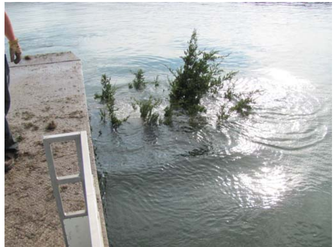
A cedar tree as it stands up and sinks to the bottom

After the trees have been dropped off, it's back to the staging area for another round. The two maintained fish attractors at Webster, the ones with the fish attractor buoys on them, have been updated on the south shore, as well as the breakwater off Goose Flats. At Keith Sebelius, trees were added to the fish attractor by the swim beach and the one on the south side, as well as around the public fishing dock and in the sandpit. Over 200, 10- to 20-foot cedar trees were placed into Webster and Keith Sebelius reservoirs this summer. So get those jigs ready and go out and see if these new trees have any new inhabitants in them. I'm sure the crappie will like them.