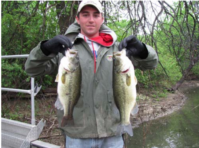
A couple nice Rooks bass

3.40 pounds. The size structure for spotted bass was five sub-stock (less than 8 inches) fish, one stock (8 to 11 inches) fish, 16 quality (11 to 14 inches) fish, and seven preferred (14 to 17 inches) fish. The biggest spotted bass sampled weighed 2.23 pounds.