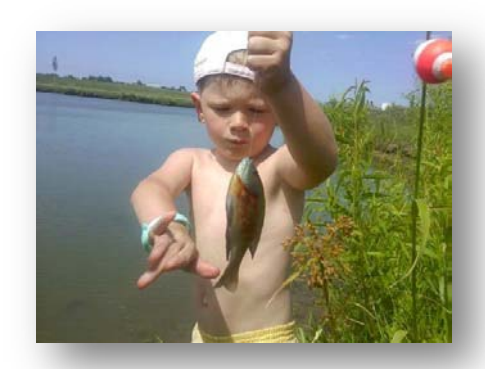
Landowners, tenants and immediate family members living with them are exempt from fishing license requirements.