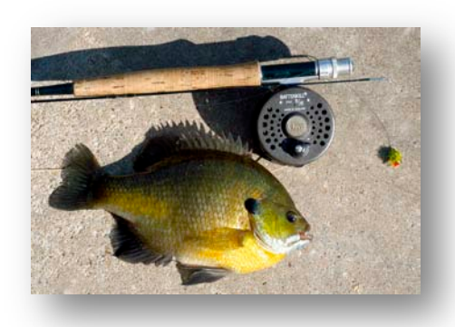
The Bluegill Sunfish (Lepomis macrochirus)