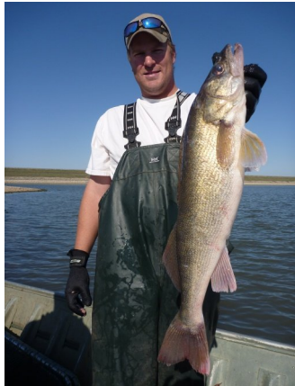
Although walleye numbers will be down at Cheney Lake in 2012, there will still be plenty of good fish to go around.

The hot and dry summer has given way to a mostly warm and dry winter. Hopefully, some much needed precipitation will fall between now and spring, as most area lakes are still feeling the squeeze of the drought of 2011. Cheney Lake is currently about 3.5 feet low, and although some smaller lakes in the district have recovered, most are still below normal level.