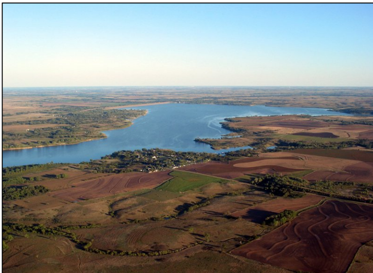
Scenic Kanopolis Reservoir lies within the Smoky Hill valley. The reservoir has 3,550 surface acres as well as a unique stream environment below the dam.