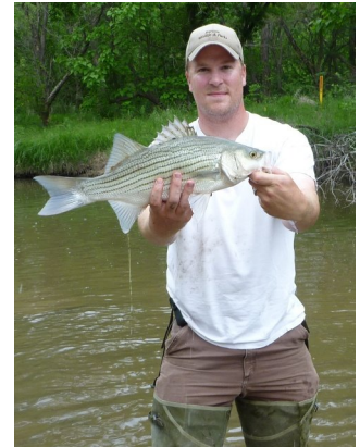
White bass and wipers will run up the Smoky Hill River above Kanopolis Reservoir, especially when the river rises during late-April through May.

Kanopolis is a good combination of a big reservoir and small lake, and has some unique habitats that will keep anglers busy year-round. Other popular activities at Kanopolis include camping and trail riding. The extensive wildlife area also offers diverse hunting opportunities for big game, turkeys, waterfowl, and upland birds. For more information on Kanopolis Reservoir, State Park, and Wildlife Area, click HERE .