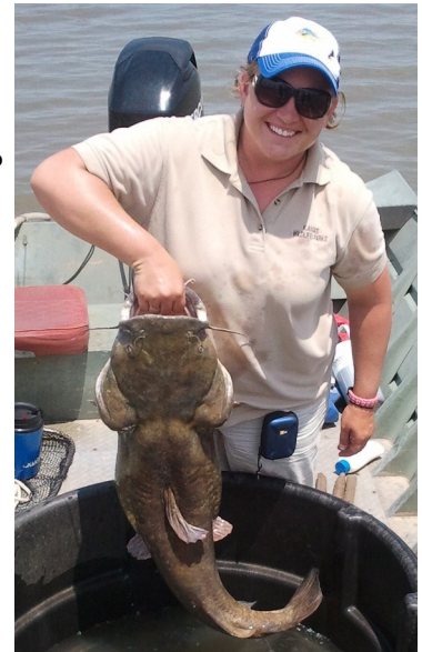
Fish with lively bait around rocks and brush for a chance at a trophy flathead. Flatheads are top predators and live fish compose most of their diet.

Although we didn't catch any giants like in previous years, we did catch fish up to 30 pounds. We usually take the sample a little bit later, so the big fish may have been holed up in nests or other habitat we couldn't effectively sample. Either way, Wellington City Lake is an excellent lake for big flatheads, but remember set lines are not legal on waters smaller than 1,201 acres, so rod and reel is the only way to get at those fish in Wellington.