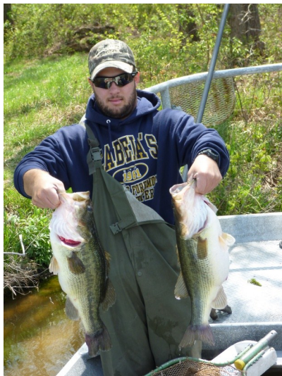
A properly managed Kansas farm pond has the potential to produce 5+ lb bass.

Hopefully these tips will help in the management of your farm pond. For more detailed information about farm pond management, feel free to contact your local fisheries biologist or visit this link on KDWP's website.