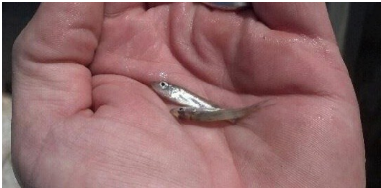
All fish that are stocked in Kansas, including these Cheney Reservoir walleyes (left), are produced using funding from fishing license dollars. Without these funds, many KDWPT fish and wildlife programs, such as aquatic education (below) would be impossible.

We realize many anglers are on a fixed income and every additional expense is a burden, but the four dollars per year for your new permit could provide the funding to stock that catfish that could get a kid hooked on fishing or perhaps pay for a few of the walleyes stocked in Cheney next year. Regardless, we appreciate all our licensed anglers and ask for your patience with the new requirement. Hopefully, this explanation has shed some light into our funding process and the reason for the new law.