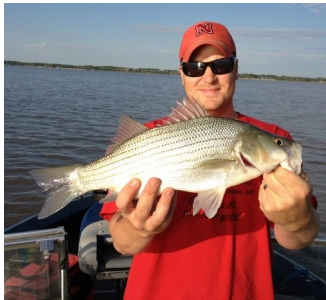
White bass at Kanopolis Reservoir and wiper fishing at Cheney should be excellent this summer.

Well, here we go again, trudging into another hot and dry summer in south-central Kansas. Although the spring weather was decent with a few timely rains, the last two weeks of 100-degree weather have most of us fearing what the next few months has in store.