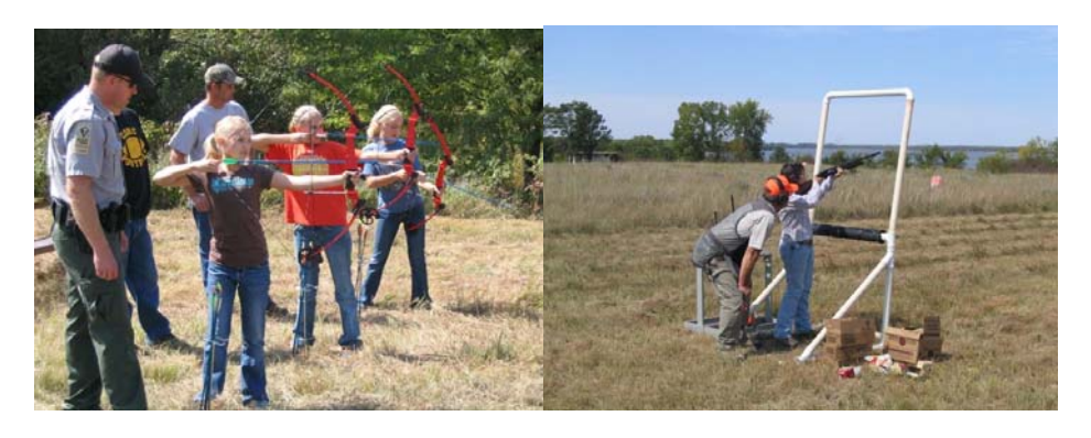
Archery station at annual outdoor youth event. Shotgun station at annual outdoor youth event.

Area youth are invited to attend a FREE shotgun, pellet rifle, and archery shooting and safety clinic on Saturday, September 22 at Council Grove Lake. Sponsored by the Kansas Department of Wildlife, Parks, & Tourism (KDWPT), The U.S. Army Corps of Engineers (COE), the Flint Hills Chapter of Quail and Upland Wildlife Federation (QUWF), and Morris County Hunter Education instructors, this special event will provide participants with an opportunity to enhance firearm and archery shooting and safety skills. Controlled live fire instruction will teach safe, responsible, and fun shooting techniques.