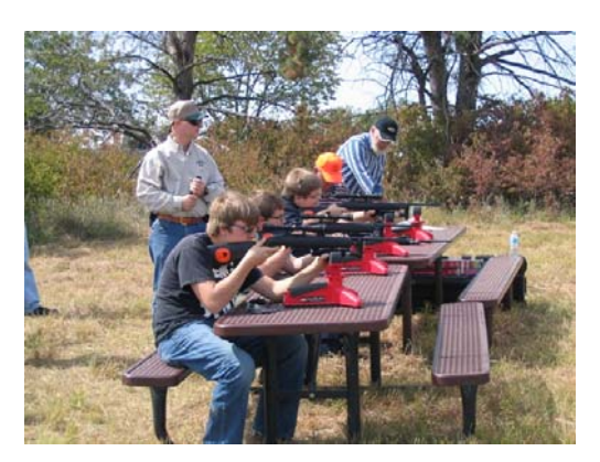
Air rifle station at annual outdoor youth event.

Anyone, age 11 through 16 may participate. Participants are required to pre-register for the event. Students are not required to have completed a hunter education course, but prior completion is preferred. The event will begin at 12:00 p.m. at the COE managed area between Marina Cove and Neosho Park, approximately 0.25 miles west of the COE office at the west end of the dam. Check-in and a free lunch provided by QUWF, will be between 12:00 p.m. and 12:30 p.m. Instruction will then begin at 12:30 p.m. and will end at approximately 4:00 p.m.