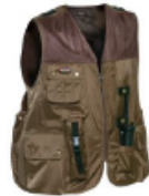
Nite Lite coon hunters vest