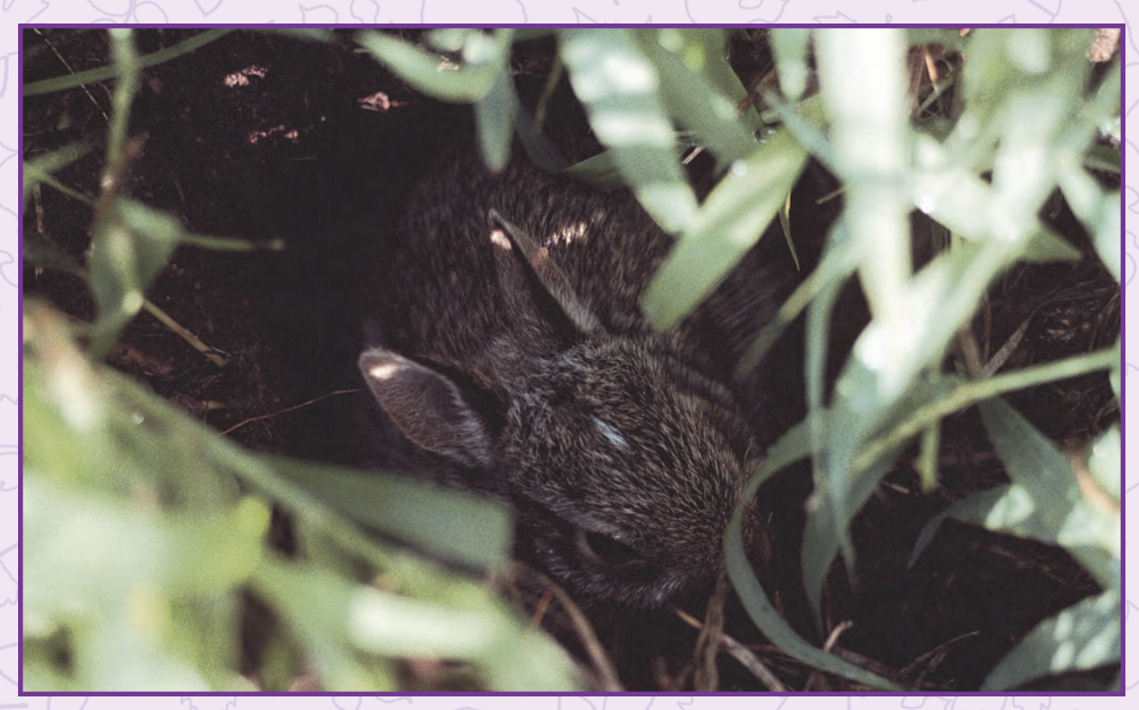
When people try to "adopt" a baby cottontail, fawn, or other wild youngster, there are a variety of problems and health hazards, to humans and animals alike. All of these problems and hazards can be avoided if people follow one simple rule when coming upon young wildlife: leave them alone!