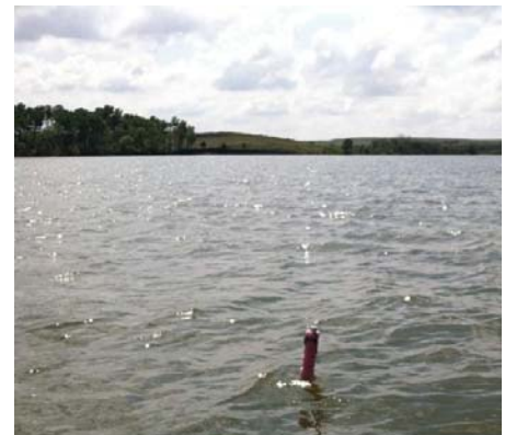
A bobbing jug indicating a bite