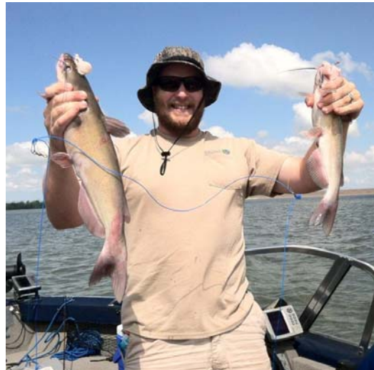
Two of the catfish captured on floatlines at Kanopolis Reservoir this September. Jugging is a fun, effective way to catch catfish.

Jugging proved to be a very effective way to catch channel catfish at Kanopolis Reservoir. It certainly provides a different experience from hook and line, trotline, or setline angling. The excitement of seeing the jugs being pulled around the reservoir by fish never got old. In the dog days of summer, when other methods of fishing might become less successful, give jugging a try at the nearest reservoir where floatline fishing is permitted.