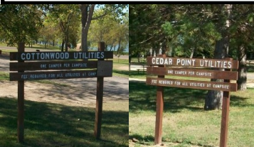
Cottonwood & Cedar Pt Utilities Upgraded to 50 amp service.

Lovewell State Park received matching grant funds last year from the Bureau of