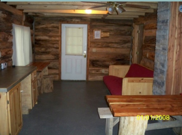
Southwinds Camping Cabin’s New Roomier Interior!

The interior renovation of the Southwinds rustic camping cabin is now complete! In the past, the Southwinds East and West cabins were two separate rentable cabins, separated by an interior wall. Each cabin had only beds and mattresses inside, with the dining area outside under a covered porch. The renovation project consisted of transforming the two separate camping cabins into one larger cabin, much like the Sunrise and Pine Ridge rustic camping cabins that have been so popular. The newly remodeled Southwinds Camping Cabin has two separate bedrooms, each with a full size bed and three single bunks, to sleep a total of 10 persons. It has a large eating area inside, with plenty of counter space and electrical outlets for food preparation. A great stone feature is being built in the living area, and a futon has been added for extra seating. One unique feature is that this cabin now has TWO covered porches, one facing the east and the other facing the west. Future plans are to partially enclose and screen one of the porches for an added feature. The cabin still has a picnic table for outdoor dining, charcoal bbq grill, separate firering, and a water hydrant located outside. With its location next to the water, close proximity to the swimming area and beach, and new roomier interior, the Southwinds Camping Cabin has quickly become one of our most popular! Available weekend dates are already thin, but why not consider a ‘staycation’ during the week? Make your reservations now!