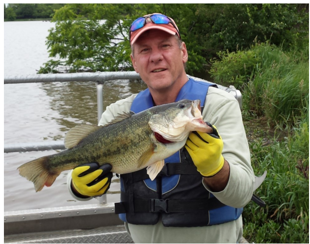
Nice largemouth bass sampled at Olathe-Cedar Lake.