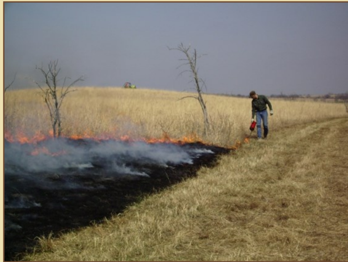
Figure 2. Mowed firebreak.