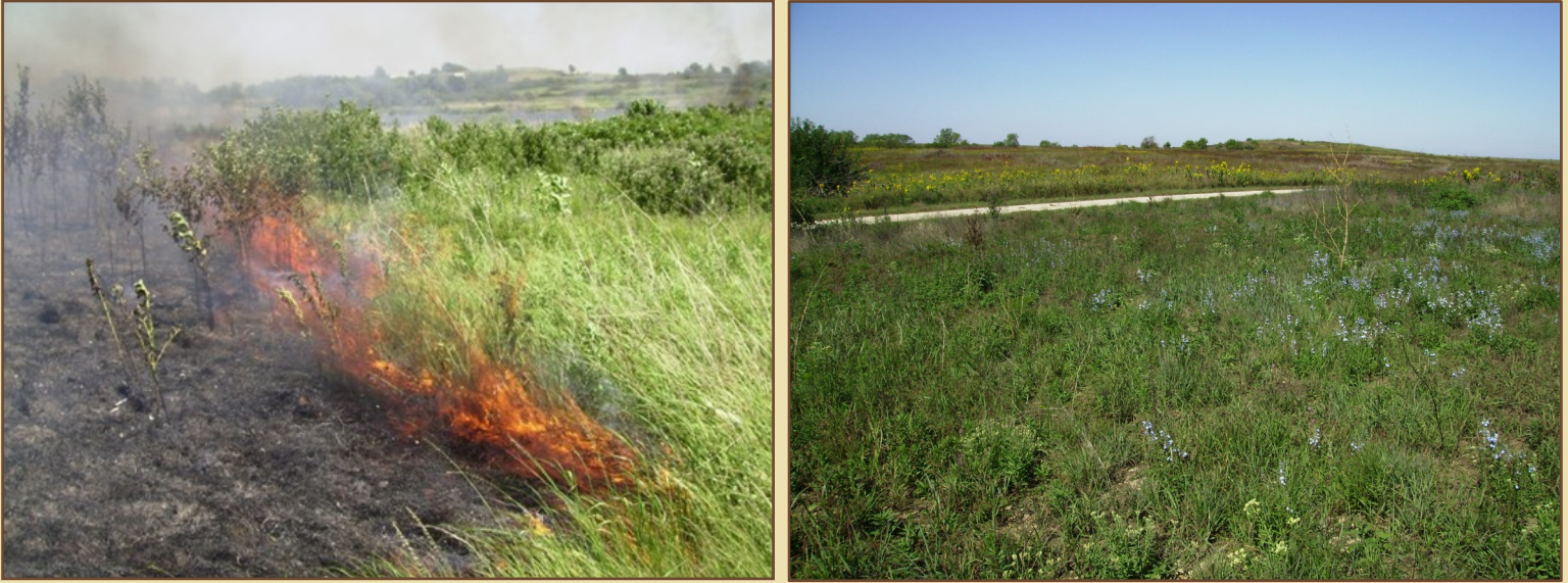
Figure 1. Summer burn conducted mid-July and regrowth 2 months after burn.