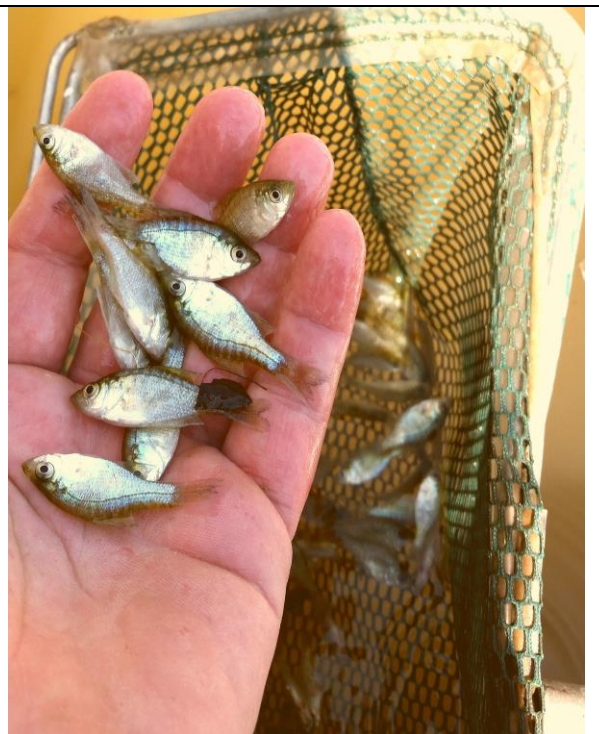
The photo on the right is the same fish being stocked into Horsethief in early August.

Normally to tell the difference between the two species, white crappie have five or six dorsal spines and black vertical bars on the sides of the body, whereas black crappie have seven or eight dorsal spines and mottled black spots on the sides of the body. Hybrid crappies do occur naturally and are often difficult to distinguish from a normal black crappie.