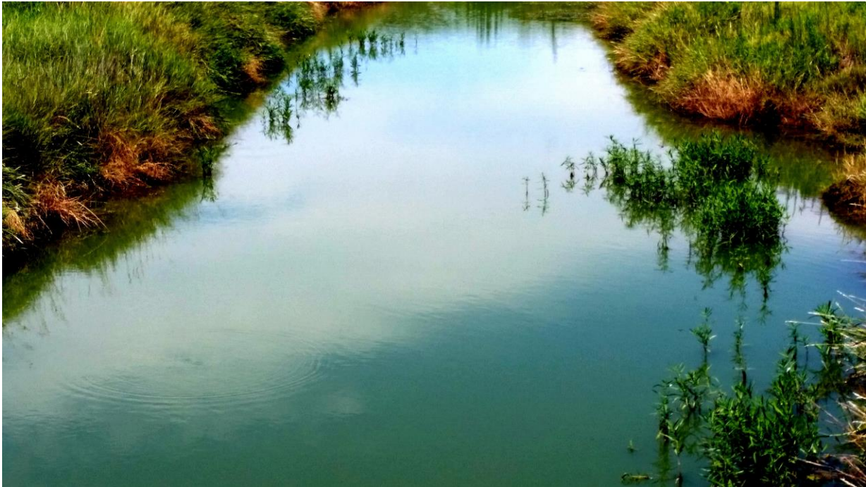
Water willow plantings from 2014 at Horsethief Reservoir beginning to form colonies.

In 2014, American Water-willow ( Justicia americana ) was first planted in Horsethief. The leaves look like those of the willow tree and that is where the name comes from. Water willow is a perennial plant and the primary goal is to provide habitat, which is sorely lacking, for the fish. Secondly, it grows to 3 feet tall and often forms dense colonies that will help stabilize shorelines, which are particularly vulnerable to erosion due to the western Kansas wind. Once established, water willow can spread from seeds or fragments. It will form extensive continuously growing horizontal underground stems that put out lateral shoots and roots at intervals, which is how colonies form and spread rapidly.