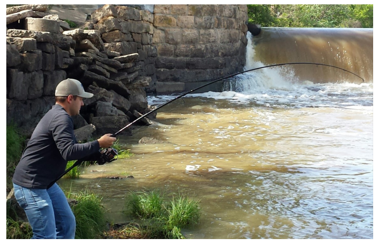
Angler battling with a paddlefish.

Equipment needed for paddlefish snagging are heavy duty rod and reel with > 30 pound test braided line. Attach large size treble hook (#8-#14) and a tear drop weight (3oz-8oz). Cast and hold on for a fight. Even smaller paddlefish put up a tremendous fight and make excellent table fare. Locations open to paddlefish snagging around the state are: Burlington City Park, Chetopa City Park, and Iola (from dam downstream to city limits) on the Neosho River, Osawatomie Dam (downstream to bridge) and Marias Des Cygnes Wildlife Area on the Marias Des Cygnes River, and the Browning Oxbow of the Missouri River.