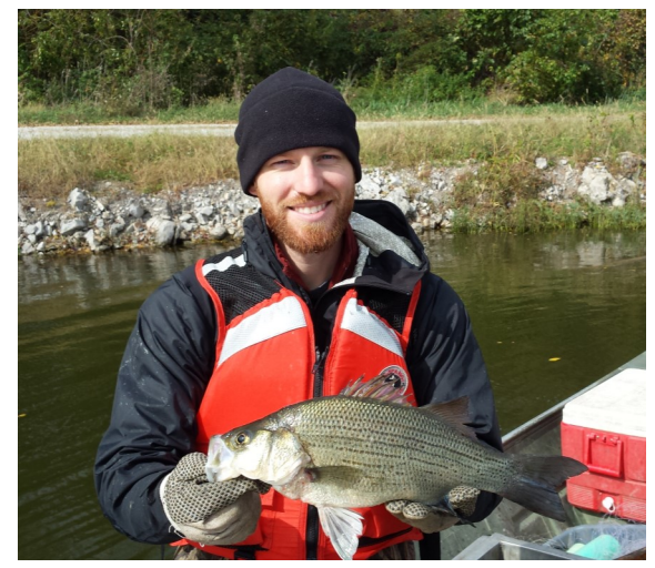
Often overlooked, there are some really nice white bass to be found in Miami State Fishing Lake

The numbers and size structure for the pan fish populations (bluegill, redear sunfish, white and black crappie) fell back a bit from the excellent numbers we saw in 2015/2016, but Miami SFL still provides quality pan fish opportunities. Good channel catfish and largemouth bass opportunities exist at Miami SFL as well. Miami SFL does have a dense stand of curly-leaf pondweed, which is an invasive nuisance plant species. We were able to get an early spring spot treatment with aquatic herbicide on the waterbody and coverage of the curly-leaf pondweed stand should not be as bad as in past years. Warmer water temperatures causes senescence in curly-leaf pondweed and the stand will be gone in early June.