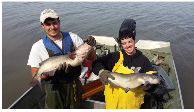
Good example of the channel catfish we were sampling at Hillsdale Reservoir in fall 2016.

The outlook for Hillsdale Reservoir in 2017 is very good. The anglers at Hillsdale are reaping the benefits of water levels that were really conducive to fish production in the previous few years. Crappie fishing through the fall and winter 2016 and on into spring 2017 has been fantastic. Fall sampling indicated some good things for the crappie population. Catch rate was 34 fish/net night and size structure metrics indicated that 46% of the population was above 10 inches, which proportionally is the highest amount of harvestable crappie in Hillsdale in over 5 years (see page 4 for a more in-depth look at the Hillsdale crappie population). Fall sampling for channel catfish was also very good with a catch rate of 4 fish/net night of channel catfish \geq 16 inches, which ranks Hillsdale as the second highest reservoir in the state for channel catfish. Catch rate of largemouth bass continues to increase, which can partially be attributed to the Early-Spawn Largemouth Bass Project ongoing at Hillsdale Reservoir (see 2016 Kansas City District Newsletters for updates on the Early-Spawn Largemouth Bass Project). Although fall catch rate of stock-length walleye (> 10 inches) was low to moderate (1 fish/net night), there is still opportunities to hook in to a real memorable fish as we captured many walleye > 25 inches during egg collection in the spring.