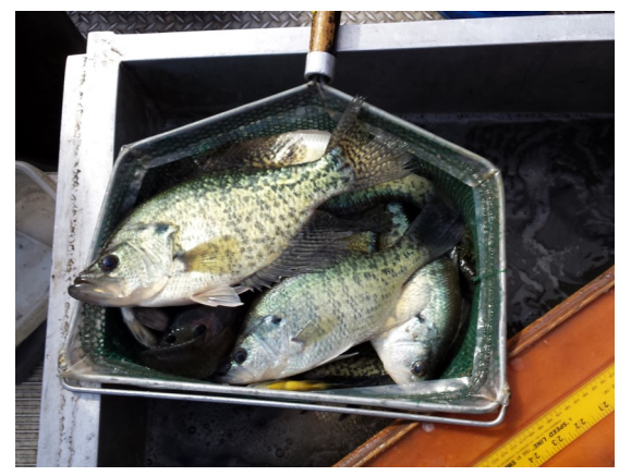
Very nice crappie at Hillsdale Reservoir.