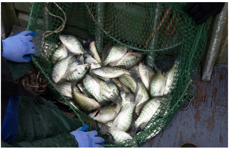
More confirmation this spring of a really good crappie population as crappie loaded our nets during walleye egg collection in March 2017.

I get questioned a lot by anglers about the 10 inch minimum length limit for crappie at Hillsdale Reservoir, with the general perception from anglers that the Hillsdale crappie stunt and stack up at 9 <sup>3</sup>/<sub>4</sub> inches. I was curious about this myself, so during the 2016 fall sampling I collected some crappie otoliths (hard structures located in the heads of fish that process sound and aid in balance), to do some age and growth analysis on the crappie population.