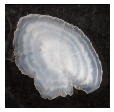
View of otolith under a microscope

Mean length at capture for white crappie captured at Hillsdale Reservoir October 2016.