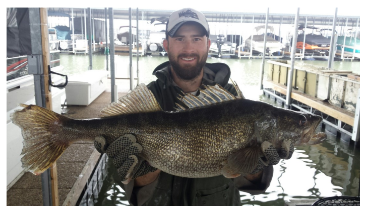
Nice female walleye caught for egg collection at Hillsdale Reservoir this spring.