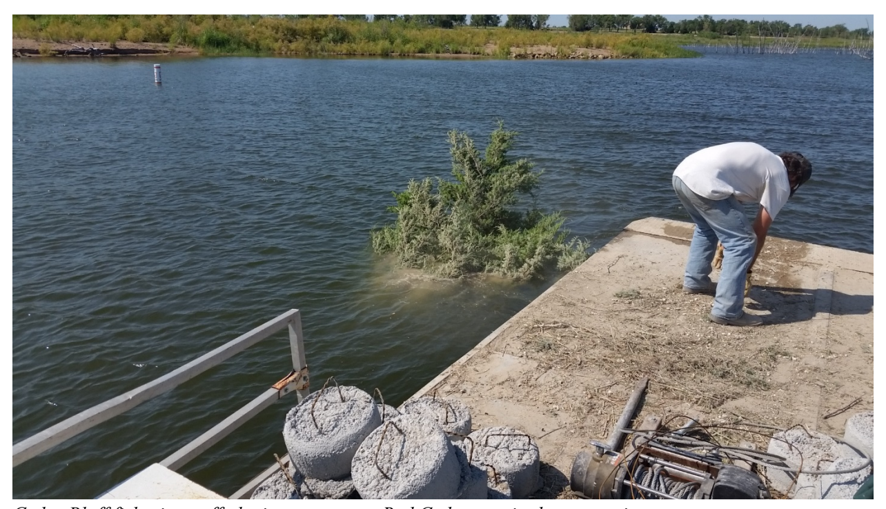
Cedar Bluff fisheries staff placing an eastern Red Cedar tree in the reservoir

Supplementation of aquatic habitat is a common practice conducted by fisheries managers. This work takes many forms and is done to meet a variety of goals. Gravel or rock can be added to shallows to provide spawning areas for fish. Aquatic vegetation can be established to provide critical nursery habitat. A common practice in Kansas impoundments is to add woody structure to concentrate fish for angler's benefits.