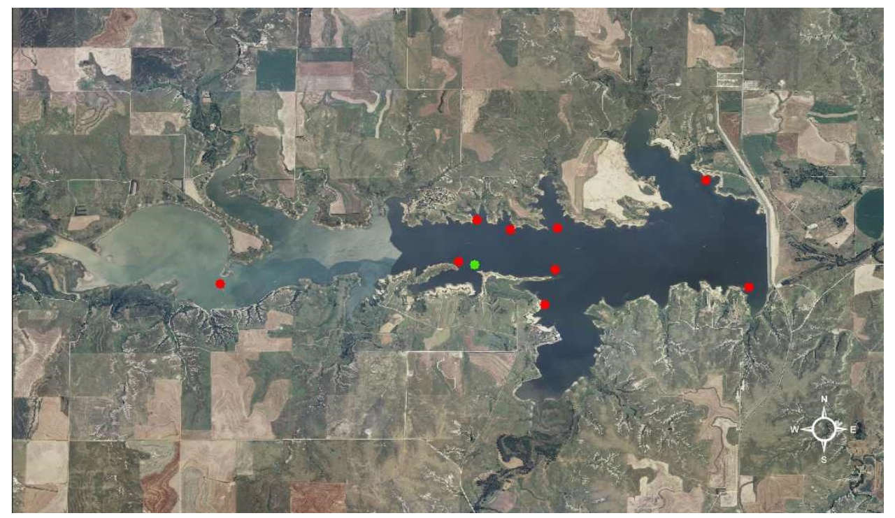
Fish attractor locations at Cedar Bluff with dots showing existing (red) and new (green) structures

During the 2018 summer a new fish attractor was established at Cedar Bluff Reservoir. The new attractor consists of approximately 70 eastern red cedar trees, more trees will be added as time allows in the future. The new attractor is located on the east point leading into Old Marina Cove. This new structure is configured differently than other attractors in the lake with it being a linear structure that spans an approximate 10-foot change in water depth. This differs from existing attractors as they are more of a round configuration placed on a flat bottom. Given the location and configuration of the new attractor it is hoped that it will mimic an underwater point and be conducive to fish concentration.