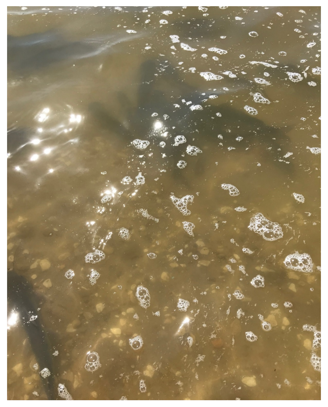
Channel catfish acclimating to their new home post-stocking

Because of hatchery surplus, 7,000 channel catfish that averaged 6 to 8 inches long were stocked September 19, 2018 into Cedar Bluff. This release is considered a low stocking rate at approximately two fish per acre. Similar stockings will be requested in upcoming years in hopes of increasing catfish abundance and ultimately improving catfish angler success. Historically, channel catfish existed in the river before impoundment and that is the origin of catfish in Cedar Bluff. Prior to this recent stocking, channel cats were only stocked once before in 1960.