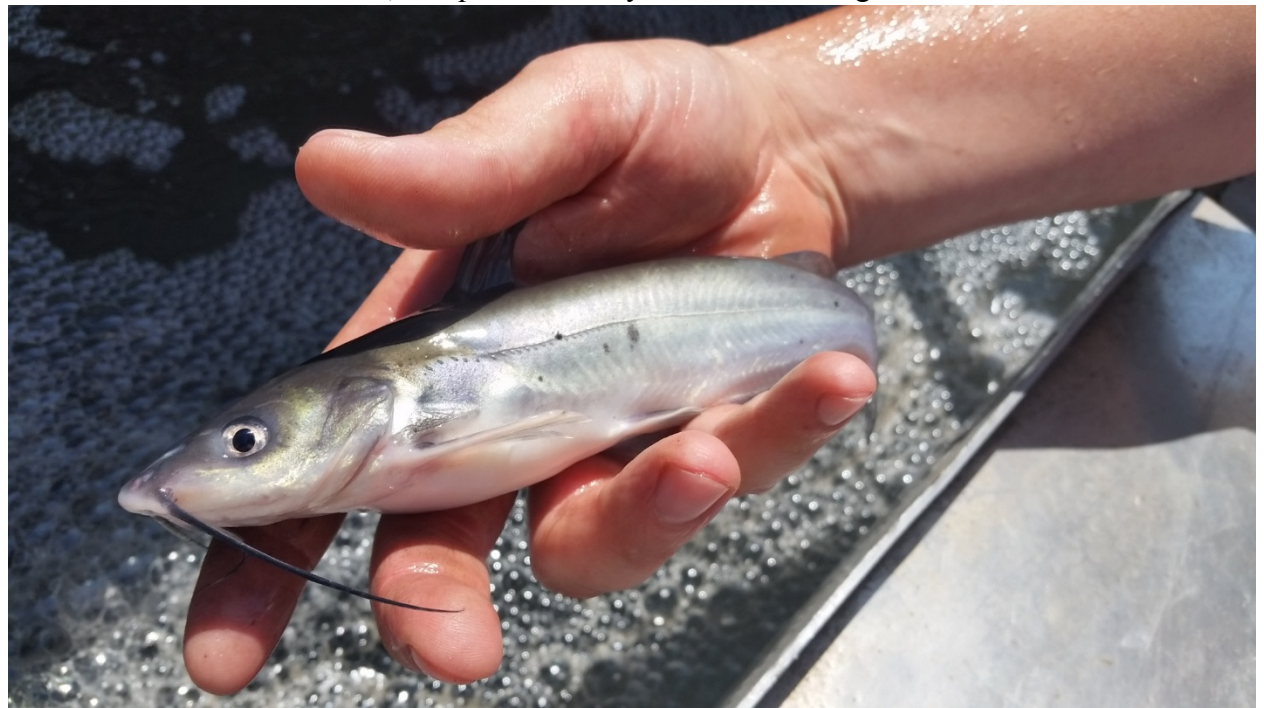
Example of one of the channel catfish stocked

KDWPT supplements channel catfish recruitment in small lakes with the release of intermediatesized fish each fall. However, this practice rarely occurs in the larger reservoirs.