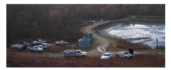
Harvest time at the Woodson Rearing Pond. Flooding in 2017 damaged the state lake and pond but repairs were completed in 2019 and rearing efforts will resume in 2020.

The Milford Fish Hatchery was completed in 1985 and is located below the dam of Kansas' largest lake, Milford Reservoir. It is the first to be designed as an "intensive" system where hands on production for all species starts from egg hatching in containers with grow out taking place almost exclusively in tanks and raceways instead of ponds. This allows staff to raise more fish per volume and monitor fish health daily. The 24 raceways are each 100 feet long, eight feet wide, and four feet deep with a capacity of 18,000 gallons of water. A recent re-tooling project used inside space to increase the state's ability to raise intermediate and advanced walleye through vigorous larviculture techniques with Meade Hatchery.