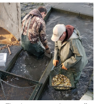
The above picture shows staff collecting fish from a pond via a "kettle." The fish collect in these structures when the pond is drained. Many call them "Kansas Kettles" as they were first used in our state!

The Meade Fish Hatchery was constructed in the 1930's by the Civilian Conservation Corps. The original Adobe buildings used by the corps are still functional. It shares its location with Meade State Lake and uses artesian wells and pumps to operate.