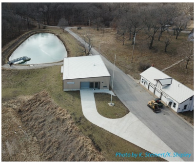
Drone photo of the new KABC pond and building