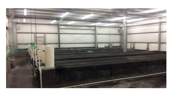
Inside the bass building, raceways are used for holding bass during the spawning efforts.

Meade is home to the Early Spawn Bass Propagation building. Brooders are brought inside in February and sorted by male and female. Staff adjust the temperature and amount of daylight, incrementally, until they fool the bass into thinking it is time to spawn. This process gives these fish a 4-6 week head start on wild bass, increasing their survival chances at many larger reservoirs.