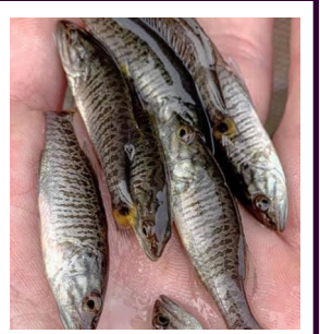
Smallmouth Bass have become a popular game fish in our reservoirs. Farlington has increased production in recent years to meet stocking demands.

Recently, the Kansas Aquatic Biodiversity Center (KABC) was constructed on the hatchery, which included a specialized pond and building. This partnership between KDWPT and the Kansas Department of Health and Environment, is intended to provide production capabilities for non-game aquatic species including minnow species and mussels. The first project tackled by Farlington staff was rearing Alligator Snapping turtles to evaluate survivability in historically native areas.