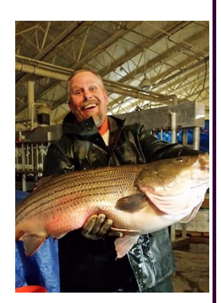
One of the bigger striper females used for striper and wiper production.

Just like the others, Milford can raise all species of fish but two unique species are "created at this facility - Wiper and Saugeye. Wipers are produced by fertilizing the eggs from stripers housed on site with white bass sperm. Saugeyes are produced by fertilizing eggs from walleye with sauger sperm. In both cases, the offspring can grow almost as large as the maternal parent but tolerate the temperature and turbidity of Kansas waters thanks to the traits from the paternal parent.