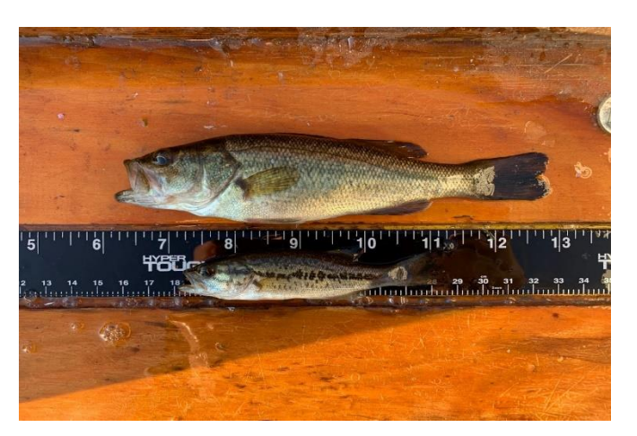
Two largemouth bass sampled in trap nets in 2019. It is of my opinion that the above is a result of the bass fry stocked in April and the below largemouth bass is a naturally spawned fish.