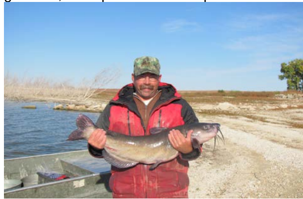
Kirwin 23 lb. Channel catfish – 2012

and/or setlines or trotlines using shad sides and gizzards, shrimp and stink or dip bait.