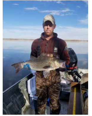
Sebelius 15.19 pound wiper – 2020

WIPERS -Good. The supply is strong, and the quality of this fishery is good as well. Fish in the 6 to 15-inch size range are especially plentiful with larger fish available as well. Individuals in the 6 to 15-inch size range accounted for 48.34 percent, 15 to 20-inch size range accounted for 46.36 percent and larger fish (20 inches plus) accounted for 5.30 percent. The biggest wiper sampled in the fall of 2020 weighted 15.19 pounds. The density rating at Sebelius (12 inches and above) is 2nd amongst all reservoirs in the state this year. Bucktail jigs that are cast into the wind along the North shore have been effective, as well as fishing night crawlers and shrimp on the bottom in Leota cove and using live bait off the drop offs outside of Leota and Concrete coves. Could also be some good top water action as these fish feed on shad.