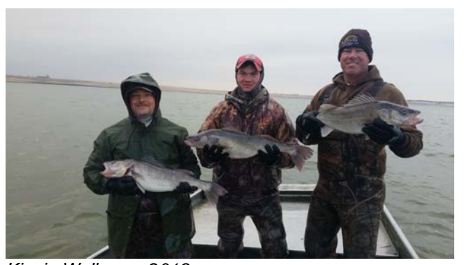
Kirwin Walleye – 2019

WALLEYE - Good . There will be some catch and release this year since individuals in the 8 to 15-inch range accounted for 57.32 percent. However, there will be some nice catches of harvestable walleye - fish in the 15 to 20-inch size range accounted for 32.92 percent, fish in the 20 to 25-inch size range accounted for 6.10 percent and fish over 25 inches accounted for 3.66 percent of the 2020 fall sample. density rating at Kirwin (15 inches and above) is 3rd amongst all reservoirs in the state this year. The biggest fish sampled this past year weighed 7.47 pounds. These fish can be caught off the Dam during the spawn in March and April casting jigs, roadrunners or crankbaits. After the spawn would get those night crawlers out and fish the flats and drop offs. A 15-inch length limit is in effect.