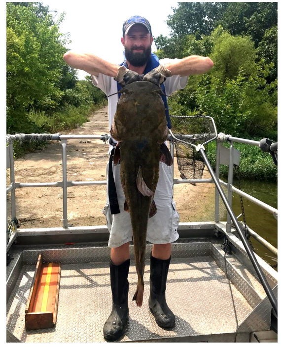
Middle Creek SFL Flathead

Fall always offers some of the best angling opportunities of the year. Predator fish are in full feeding mode to pack on weight for the winter. Changing weather patterns usually have fish on the move as well. A great time to get out, enjoy the weather, and catch lots of fish!