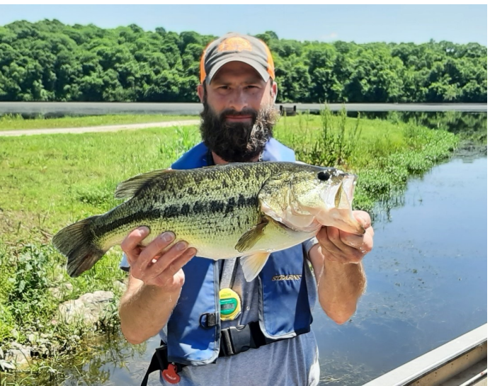
Miami Co. SFL Lunker