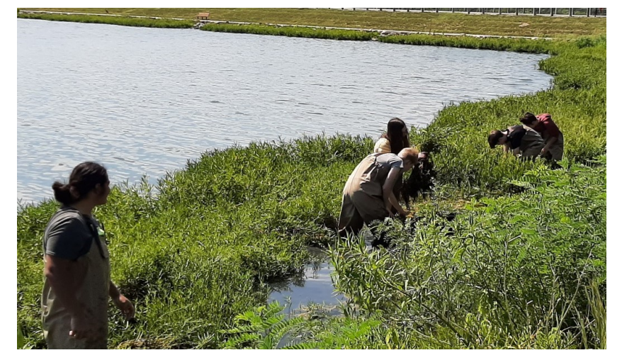
Students Harvesting Water Willow Plants for Propagation Project