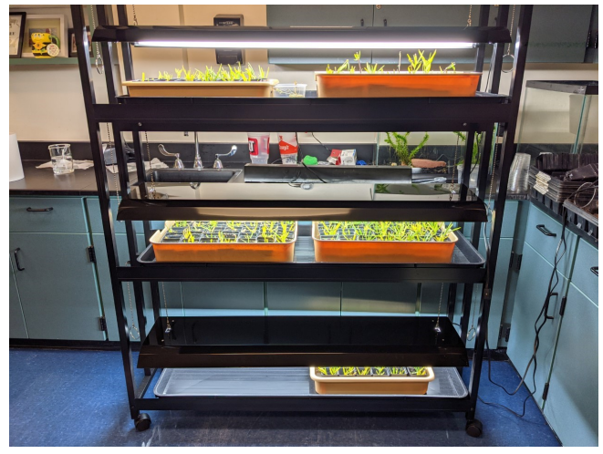
Plant Cuttings Growing in Gardner-Edgerton High School Lab