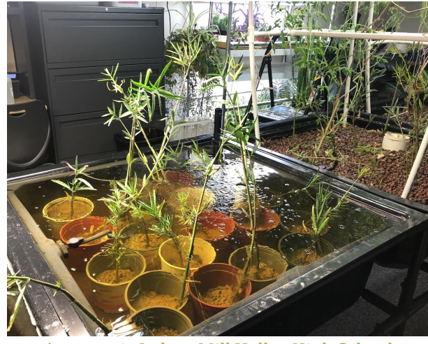
Aquaponic Lab at Mill Valley High School