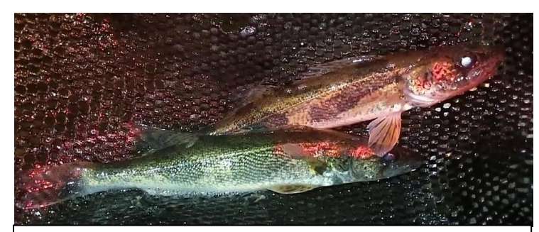
Baby Sauger at the top of the picture above and a young Walleye at the bottom. The graph below shows how the two species performed together their first year at Make-Up Lake – this graph just shows the small fish collected.

young Sauger will start reaching the 15" minimum length limit by this time next year.