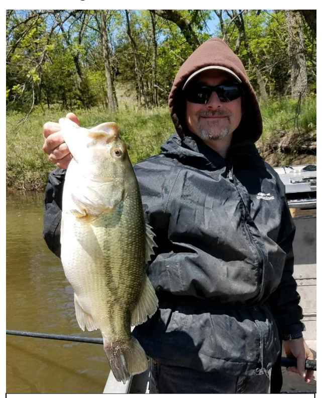
Largemouth Bass from Washington SFL. Doesn't even look real to me with how fat and short it is. The lake holds some nice bass.

The crappie fishery is currently dominated by small fish and there were none over 10 inches in the last sample. Saugeye numbers continue to be low due to poor survival from the last few stockings. The lake is home to a good Channel Cat fishery with 24% of the last sample over 24 inches long.