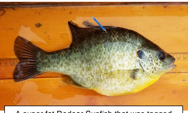
A super fat Redear Sunfish that was tagged for the fishing derby held last spring.

This lake was also in the Great Kansas Fishing Derby in 2021. Five of the fourteen tagged fish were reported as caught: 3 Channel Catfish and 2 Largemouth Bass (one of which was caught twice). The lake received 3,526 larger Channel Catfish through the Urban Stocking Program. The lake's crappie have been growing a little bigger in recent years due to improvements in the forage base. The Redear Sunfish population has also been doing well with sample numbers being above the long-term average for the last four years. The lake is occasionally stocked with Saugeye to maintain a few for angling and there currently is decent numbers of 15-inch Saugeye in the lake. This lake has a great Largemouth Bass population.