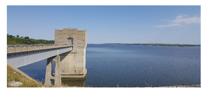
Tuttle Creek Reservoir

If you are keenly interested in the Manhattan area, then please read on for my analysis of some of the local lakes (plus fish sampling pics). Black bass data is collected in May and that information is usually in my summer newsletter.