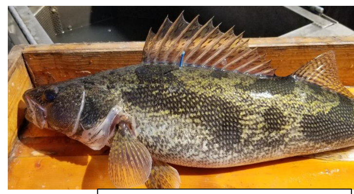
A Derby tagged Saugeye from Pott#2

20"-24" fish. The lake had 14 tagged fish for the Great Kansas Fishing Derby, three of which were caught: a Warmouth, a Black Crappie, and a Largemouth Bass.