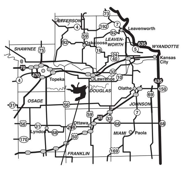
Clinton Reservoir, State Park & Wildlife Area

Download the Camplt KS mobile app today and reserve your Kansas State Park campsite from anywhere, on any mobile device! Available now in the Apple App and Google Play stores.