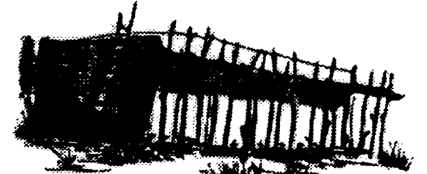
El Cuartelejo Indian Pueblo

Historic Lake Scott SP & WA 101 W Scott Lake Dr. Scott City, KS 67871