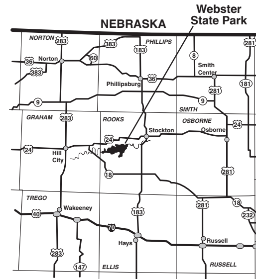
General Area Map

Dane G. Hansen Museum is six miles west and 18 miles north of the park. It contains collections of American and foreign coins, European and western guns, art from around the world, as well as traveling exhibits from the Smithsonian Institution.