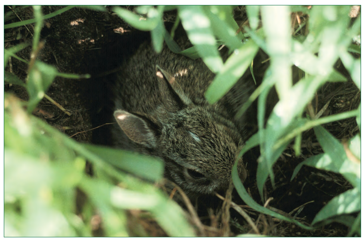
There are a variety of problems and health hazards, to humans and animals alike, when people try to "adopt" a baby cottontail, fawn, or other wild youngster. All of these problems and hazards can be avoided if people follow one simple rule when coming upon young wildlife: Leave them alone!