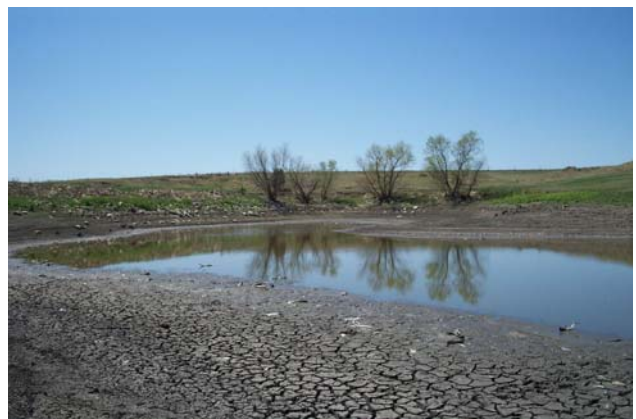
Drought stricken farm pond subsequent to water level-related fish kill

During the first half of this past decade, prevailing drought conditions throughout the Cedar Bluff District caused many farm ponds to dry up or become critically low, eliminating existing fish populations. Now with the return to a wetter weather pattern, many farm ponds have refilled. If you happen to own such pond or know some one who does, you may be interested in reestablishing a fishery in a newly-filled pond. Following in this article are a few hints relative to pond restocking and management that will hopefully help you optimize the quality of the fishery in your pond.