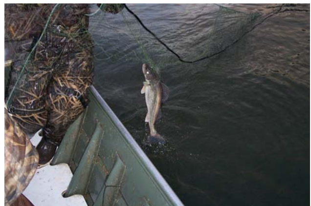
A female walleye caught in a gill net during walleye egg collection. Trap nets are also used to primarily capture male walleye during the spawn.

Every spring during late March and early April, walleye and sauger in Kansas lakes move into dams and other rocky areas to spawn. During this timeframe, KDWP fisheries staff collect and fertilize eggs from wild broodfish to provide the raw material needed for hatchery production of walleye, sauger and saugeye fry and fingerlings that are stocked at public fishing waters statewide. To maximize the efficiency of the egg-collection process, donor lakes are selected based upon walleye population dynamics. Lakes that harbor populations composed of high numbers of large females are preferred since the larger the female walleye the more eggs the fish will yield.