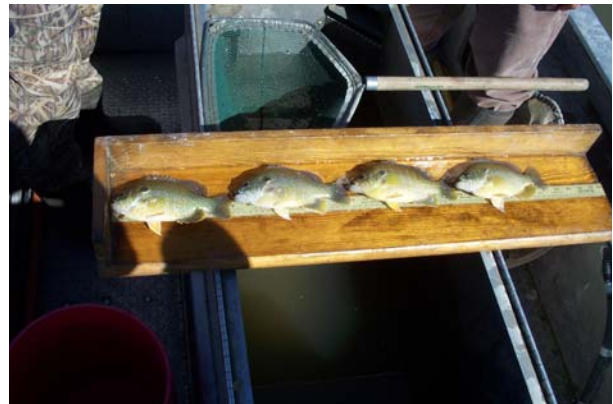
Quality hybrid bluegill from Atwood Township Lake

catfish, and adult hybrid sunfish were stocked. The minnows did their job and produced an abundant forage supply for predatory sportfish, resulting in good catfish and sunfish growth. As of last fall, fair numbers of catfish up to 3.5 pounds and hybrid sunfish in the 7- to 8-inch range were available. Furthermore, stocking of intermediate-sized channel catfish during the fall of 2009 improved the overall number of catfish. The adult largemouth bass stocked during the summer of 2009 also benefited from the abundant forage in Atwood such that bass body condition is excellent and quick growth has resulted in the availability of fish up to 3 pounds.