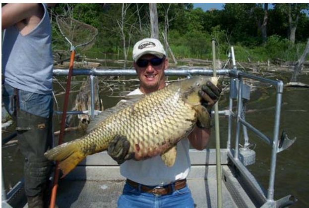
Common carp specimen from Ellis City Lake

The gizzard shad population at Ellis has also expanded to nuisance proportions. Oftentimes, gizzard shad are a poor fit in small impoundments because they compete directly with young fish of all species for food. And in a productive lake like Ellis, gizzard shad grow quickly and out grow their usefulness as a prey source for desirable sport fish.