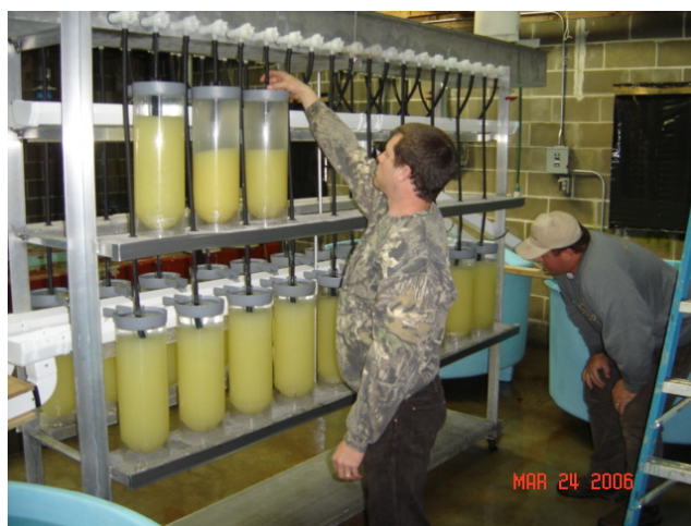
Hatchery staff tending to walleye eggs in an incubation battery

The egg collection operation at Cedar Bluff yielded a total of 59.8 million eggs, accounting for 62 percent of the total statewide walleye egg harvest. To make it more tangible, that is approximately 120 gallons of walleye eggs. The hatch rate for eggs harvested at Cedar Bluff was approximately 58 percent, yielding 35 million fry and 653,000 fingerlings for stocking in Kansas waters.