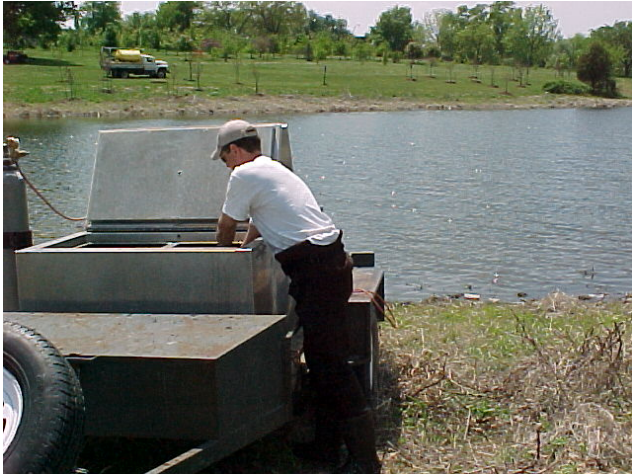
Some typical fish hauling equipment such as an insulated hauling box and compressed oxygen cylinder

The best source of fish for stocking is from a reputable commercial fish producer. A list of Kansas commercial fish producers can be found at www.kansasaquaculture.org or obtained from a local KDWP, County Extension, or NRCS office.