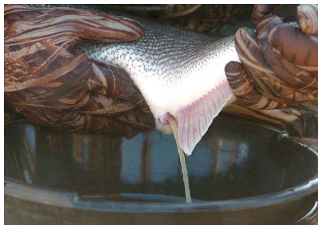
Pressure is applied to the ovaries of the broodfish to release the eggs.

fingerling walleye were requested statewide and the statewide walleye egg quota was set at 100 million, figuring an egg hatch rate of approximately 50 percent.