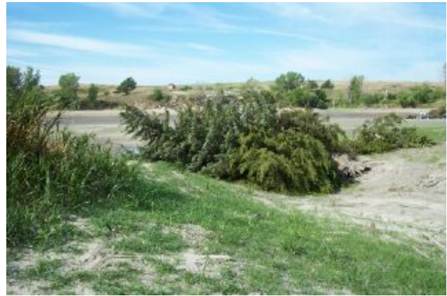
Cedar tree fish attractor installed in a dewatered lake basin

With any fish habitat improvement project, placement of structures adjacent to changes in bottom topography enhances the effect of the structures. Placement of structures that involve penetration of the pond bottom should be avoided in pond basins that are sealed by liners or other basin sealants like bentonite. The bottom line relative to fish habitat construction is be creative and try to think like a fish.