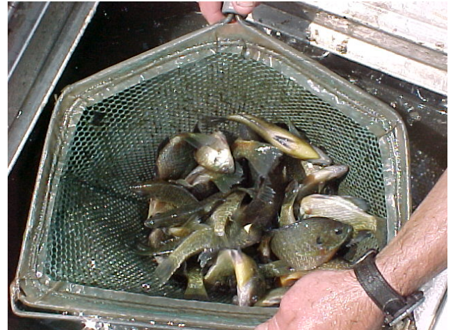
Dip net full of advance-sized bluegill just prior to stocking

the cheapest regime. However, stocking small fish will require allowing a couple of years for fish to grow before any real fishing opportunities are realized. It is also important to stock the right number of fish to hedge against creating imbalances in the fishery. Stocking fingerling-sized fish at the following per-acre rates are recommended; 100 largemouth bass, 500 bluegill, 100 channel catfish, and 3 pounds of fathead minnows.