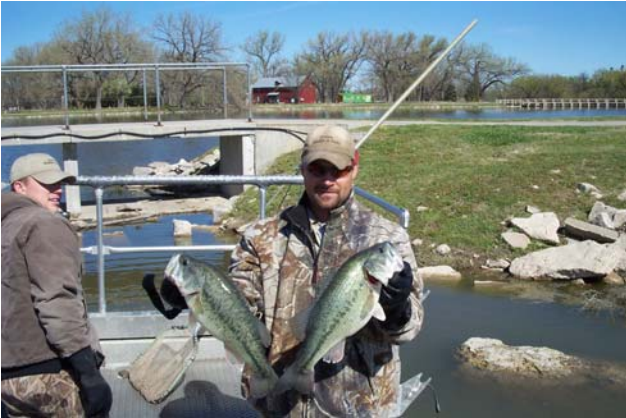
A couple of nice Atwood Township Lake largemouth bass

catfish have been stocked. Intermediate- to adult-sized bass and flatheads capable of preying on the carp were stocked at Atwood. In addition to largemouth bass and flathead catfish, stockings of saugeye and striped bass hybrids have been requested and should be stocked during 2010, depending on availability from our hatchery system.