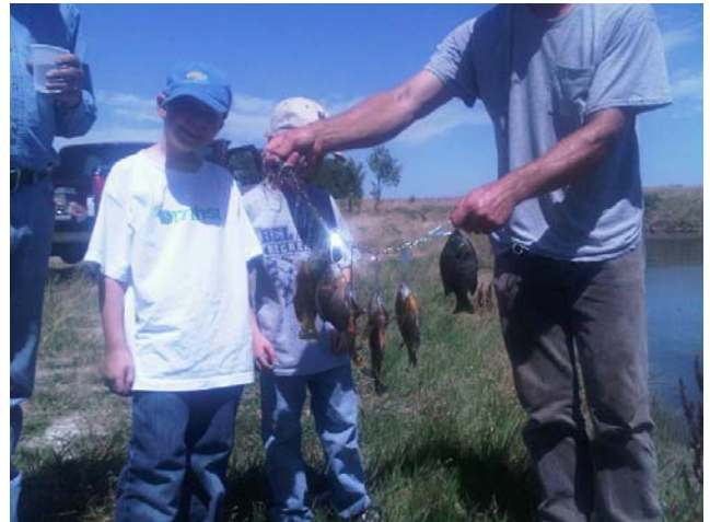
A common management objective for establishing a pond fishery

Another way to reduce stocking-related stress is to acclimate the fish prior to stocking by slowly equalizing the temperature of the hauling water to that of the pond. In general, smaller fish are less tolerant to a change in temperature, so the hauling water should be within two degrees of the temperature of the pond before the fish are released. Larger fish tolerate a greater temperature differential, but it is still best to get the temperature of the hauling water and pond as close as possible.