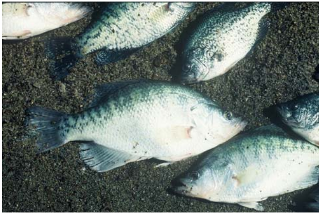
Crappies from the heyday in the late 1990's

Over the past 10 years, the Cedar Bluff crappie population, consisting of both black and white crappie species, has declined to levels well below what was realized during the late 1990's. Reduced crappie abundance has been due to factors associated with the effect of reservoir water level decline on crappie recruitment. However, from 2007 to the end of 2009 the reservoir water level has remained low but relatively stable. Fall 2009 standard sampling detected the formation of a relatively strong 2008 cohort of white and black crappies that recruited to age-1. Although the 2008 crappie cohort was strong compared to recent year classes, it is suspected that the 2008 year class was only abundant enough to moderately improve overall crappie abundance.