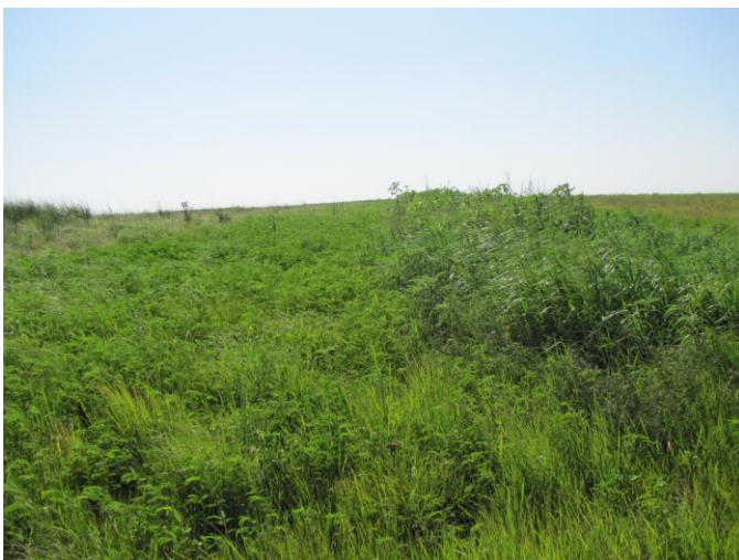
Disked strip in native grass.

Staff will continue the upland strip-disking project this spring and early summer. Results from last year's limited efforts were very positive (See pictures below) and provided very improved conditions in unproductive grass tracts. Staff has budgeted and bid solicitation is complete on a new 14-foot heavy disk specifically for continued efforts of strip disking upland sites and turning tough soils in marsh units. This unit will drastically improve our ability to manage the vegetative communities to favor annual plants as opposed to perennial plants.