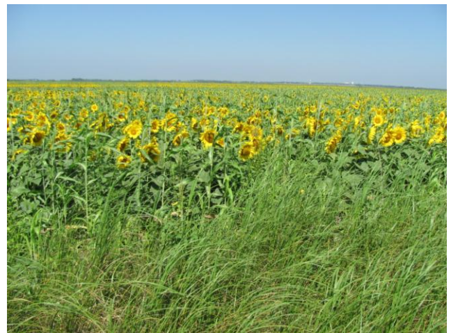
Farland Lake sunflower / dove field.

As we have for the last two years, KDWP will have a dove management field on the farthest-east edge of the Farland Lake Unit southeast of Inman. This field is approximately 60 acres of sunflowers, of which 25 percent will remain as KDWP's share. This 25 percent will be mowed in stages prior to the September 1 dove season opener. This field is located one mile north of 11 th and Arapahoe. There is an iron ranger on site where hunters can pick up daily hunting permits, and remember non-toxic shot must be used for hunting doves.