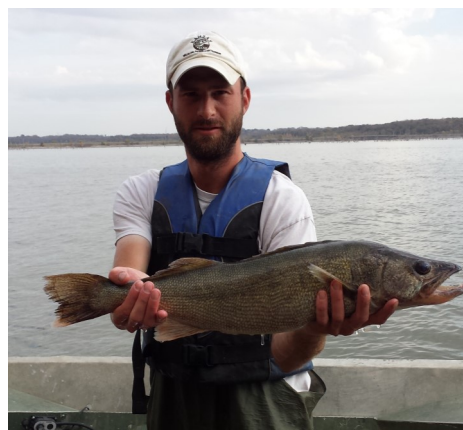
Walleye sampled at Hillsdale Reservoir fall 2015.