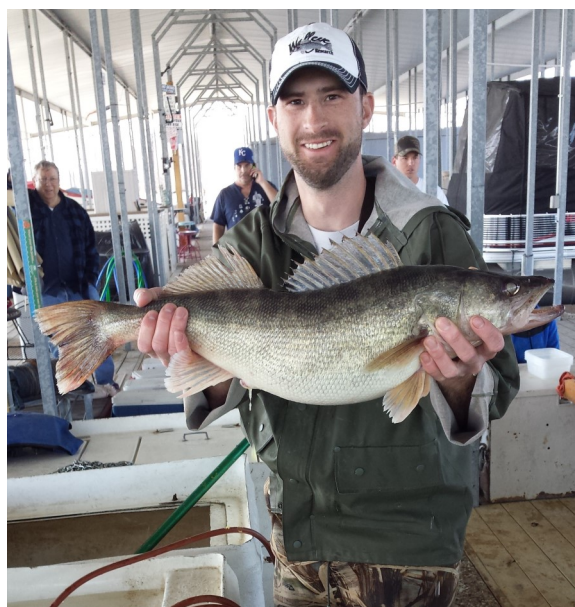
Nice female walleye caught for egg collection at Hillsdale Reservoir this spring.

Springtime is a very eventful time here in the Kansas City District. We had another successful year of walleye egg collection at Hillsdale Reservoir, approximately 37 million walleye eggs were collected to help produce walleye and saugeye statewide. The early-spawned largemouth bass project is entering the fourth year of research (update on page 4). The Urban Channel Catfish Stocking Program is in full force with 22 area waterbodies stocked once a month (March-September) with catchable size (12-18 inches; 0.75-1.5 lbs.) channel catfish (19,969 lbs. of channel catfish stocked in Kansas City District annually). Habitat improvement projects and numerous youth fishing events are scheduled area wide. These are just a few of the numerous projects to be excited about here in the Kansas City District.