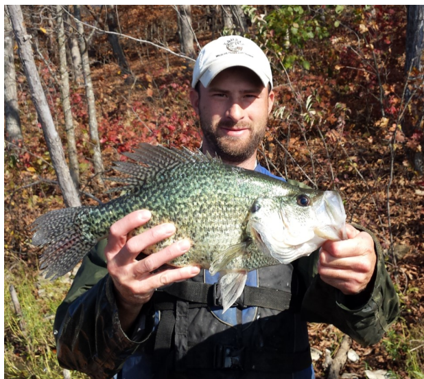
16.5 inch black crappie sampled at Miami SFL fall 2015.