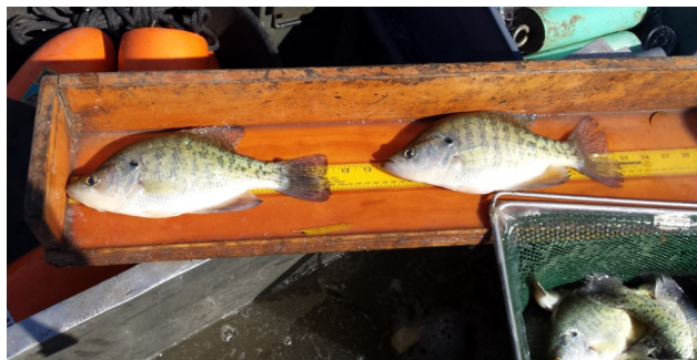
White crappie sampled at Hillsdale Reservoir fall 2015.

The timing and duration of the high water Hillsdale received in 2015 was very beneficial to fish production. Catch rate of young-of-the-year white crappie was 21 fish/net night (highest rate in past 5 years) and walleye and largemouth bass year-class production was very good as well. You should be able to harvest more white crappie in 2016 as well, as 38% of sampled fish were > 10 inches (also proportionally the highest in 5 years). Although fall catch rate of stock-length walleye (> 10 inches) was low to moderate (2 fish/net night), we saw good numbers and plenty of big walleye (both males and females) during egg collection this spring. We are anticipating good things in the future from the largemouth bass population as there is high abundance of young fish, hopefully the size structure will follow suit and improve. Twenty-three percent of stock-length largemouth bass sampled last spring were > 15 inches. Good angling opportunities are expected for white crappie and white bass, and fair to good opportunities for channel catfish, largemouth bass and walleye in 2016.