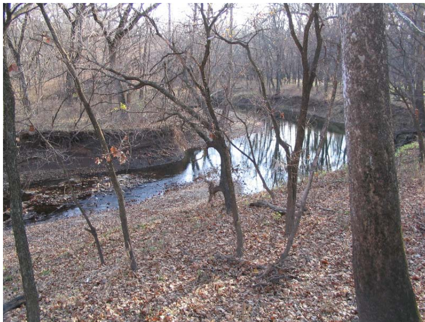
The favored fall season is upon us. Get out and enjoy some time in your favorite neck of the woods!

The “Habitat First” program has been recently unveiled to assist landowners with creating, enhancing, or restoring wildlife habitat on their lands. Wildlife Biologists can meet with you on your property to discuss your goals and review existing habitats. From those initial discussions they can help you to develop a wildlife habitat management plan and provide details about programs and partners that may provide financial assistance to help meet your goals. In addition, biologists maintain an impressive library of information on the KDWPT web site that provides wildlife habitat enthusiasts with an array of helpful information. Within that library, habitat management practices are described and illustrated and may include practices designed to enhance many types of habitats for wildlife including grazing lands, hay lands, cropland, CRP, wetlands, and riparian areas and forests. Financial assistance may also be offered for implementation of some practices! Want to learn more? Visit the KDWPT web site at www.ksoutdoors.com or contact the wildlife biologist assigned to your county for more information. Landowners in Morris, Chase, and Butler Counties can contact Jeff Rue at #316/322-7513 to learn more about how the “Habitat First” program can assist you.