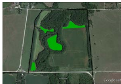
Cole Creek Area. 2014 habitat planting locations.