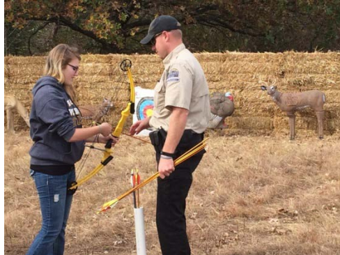
Instructors share valuable insight and experiences from a lifetime of participating. They do so with the hope of developing future hunting conservationists that place high value in the qualities of stewardship, ethics, and respect.

Success cannot only be measured in terms of safety, but also in enhanced student knowledge and character. Volunteer instructors serve as liaisons between the sporting public and the KDWPT. They share experiences, values, and lessons learned over a lifetime of participating. They share hard lessons witnessed or learned themselves in the hopes of preventing similar outcomes with students. They share personal and professional passions hoping to instill similar views. They serve as mentors, illustrating the wonder of nature, the challenge of the pursuit, and the reward of a day spent afield. Those discussions and experiences with students reinforce many mid-western values, including lessons of respect, ethics, conservation, stewardship, and the value of education and our natural resources.