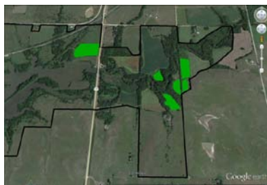
Durechen Creek Area. 2013 habitat planting locations.