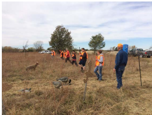
Kansas law requires those hunters born after July 1, 1957 to complete a hunter education course. Exceptions do exist, but if you intend to hunt on land other than your own, you will eventually have to complete a hunter education program.

Is the program successful? The answer to that question can depend upon how you measure. The Kansas Hunter Education program has been attributed with the reduction of hunting related injury incidents. Recent estimates indicate that nearly 3 million days of hunting occur in Kansas each year. At the same time, ONLY 6 to 20 hunting related injury incidents are reported each year! Of course even one incident can be argued to be too many, but careful review of each incident illustrates that a violation of basic safety rules was committed. Without those violations, these incidents would not occur. Basic safety rules are of course stressed, illustrated, and practiced at each class in the hopes that they will be implemented throughout the students hunting years.