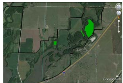
Walnut River Area. 2015 habitat planting locations.