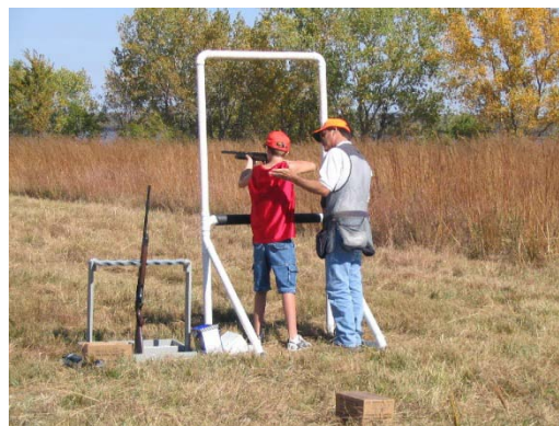
Live fire exercises conducted at many classes, reinforce classroom instruction, and provide hands-on learning opportunities of firearm basics, safe handling, and shooting fundamentals.

Is the program successful? The answer to that question can depend upon how you measure. The Kansas Hunter Education program has been attributed with the reduction of hunting related injury incidents. Recent estimates indicate that nearly 3 million days of hunting occur in Kansas each year. At the same time, ONLY 6 to 20 hunting related injury incidents are reported each year! Of course even one incident can be argued to be too many, but careful review of each incident illustrates that a violation of basic safety rules was committed. Without those violations, these incidents would not occur. Basic safety rules are of course stressed, illustrated, and practiced at each class in the hopes that they will be implemented throughout the students hunting years.