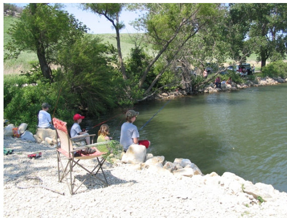
Youth days like those planned for May 6 at Council Grove Lake provide families with excellent opportunities to experience outdoor Kansas, while also learning more about pastimes, like fishing, that can be enjoyed for a lifetime!