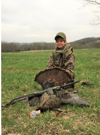
Successful youth turkey hunt participant!