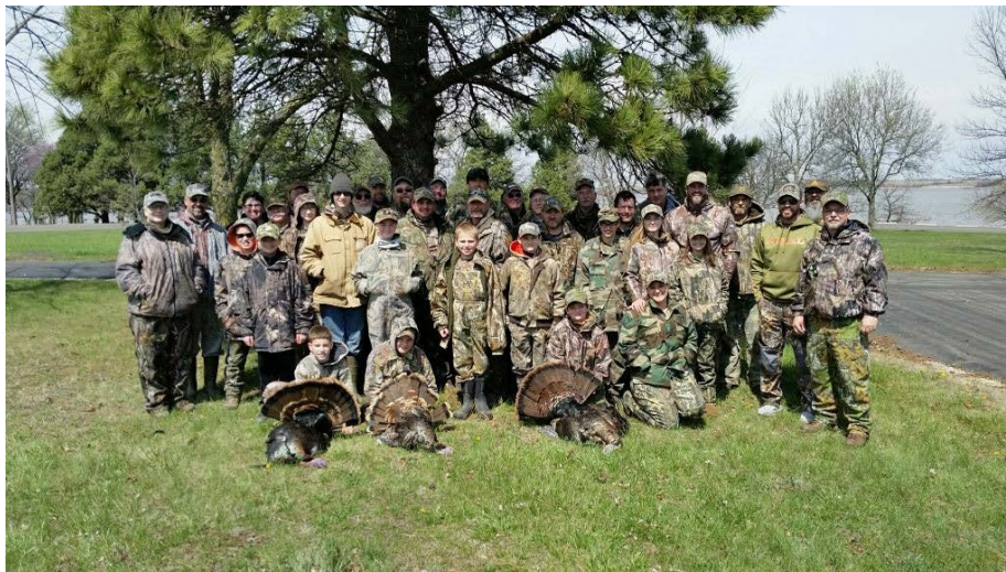
2017 Youth Turkey Hunt Participants