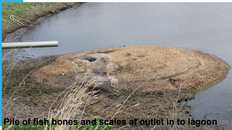
Pile of fish bones and scales at outlet in to lagoon

There are plans to move the structure to another location in the park but there is no timeline as to when that task will be accomplished, likely not this summer. So, people who fish Perry will have to clean their fish on their tailgate or at home and feed your tomatoes or the neighborhood cats with the carcasses.