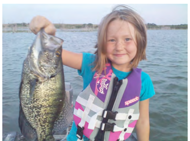
* A very satisfied Kirwin angler

We are delighted to partner with the City of Agra in developing additional fishing waters for the angling public. However, even if you are not an angler, you should visit this historic lake for a stroll around the lake on the walking trail or just take a moment for some fresh air and enjoy all the hard work that the City has done on this renovation project. It is still a work in progress that will only just get better. Enjoy the lake and PLEASE help to keep it CLEAN.