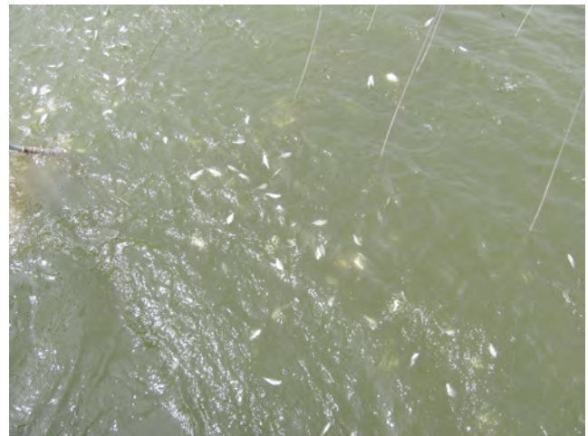
* Young-of-the-year shad sampling.

Young-of-the-year (YOY) shad sampling was completed this past August at Webster, Kirwin and Keith Sebelius reservoirs. Young of the year shad are sampled by selecting 10 random sites throughout the water body and then sampled for 360 seconds of energized field time. When all is said and done, one hour of effort is expended at each impoundment. This sample is performed to determine what size the shad are and how many are available for the larger fish to utilize. These YOY fish are the ones that help sustain all the other fish and maintain them through the winter. The goal is typically around 250 fish per site with 50 percent of them being under 70 mm. All three reservoirs are looking pretty good with most of the fish being able to utilize them for food. However, I would like to see more numbers at Webster and smaller ones at Webster, Kirwin and Keith Sebelius.