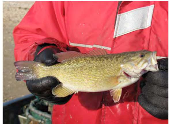
* Webster smallmouth bass sampled in 2011