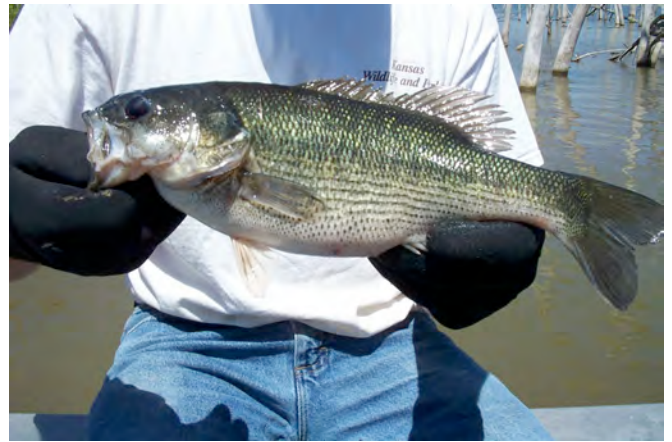
*Sebelius spotted bass

BLACK BASS - Good. The largemouth bass population is dominated by 8- to 11-inch fish, which account for 30 percent of the sample. Largemouth bass in the 3- to 7-inch size range accounted for 25 percent of the sample, fish in the 12- to 15-inch size range accounted for 26 percent and fish over 15 inches made up 19 percent. The biggest largemouth bass sampled weighed in at 4.44 pounds. Good numbers of spotted bass are also present with 24 percent being in the 3- to 7-inch size range, 6 percent being in the 8- to 10-inch size range, 29 percent being in the 11- to 13-inch size range and 41 percent being in the 13- to 17-inch size range. By spring, these fish should all be 2 to 4 inches bigger. The biggest spotted bass sampled weighed in at 1.93 pounds. Spinner and artificial baits should work well in Leota cove, along the dam, Shoen's cove and up the river channel by the sandpit. Fish the rocky areas for the spots. A 15-inch length limit on largemouth and spotted bass is in effect.