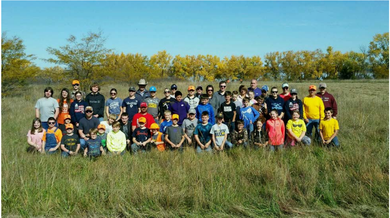
2018 Outdoor Youth Event Participants. This marked our 15 th year for the event designed to encourage participation in the shooting sports and hunting. Since inception the event has served over 700 participants!

Would you like more information about the Council Grove Wildlife Area?