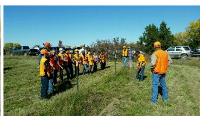
Hunting Safety Skills Station