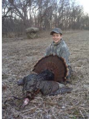
Successful youth spring turkey hunter.

Turkey: The fall hunting outlook for turkey on the area is fair. Although still locally common, turkey numbers have declined recently on the wildlife area as a result of diminished production following significant flooding in 2015 and “modest at best” production in 2016 and 2017. Area turkey production appears to have been improved in 2018, but populations remain below those experienced prior to 2015. Hunters are reminded that a flood in October has negatively impacted some woodland habitats adjacent to the lake and are encouraged to consider those impacts when planning a hunt. Prior to declines in turkey production beginning in 2015, turkey populations benefited from good production dating back to at least 2012. As such, turkey hunters are likely to find that area flocks contain a greater proportion of experienced adult birds which may make hunting more difficult.