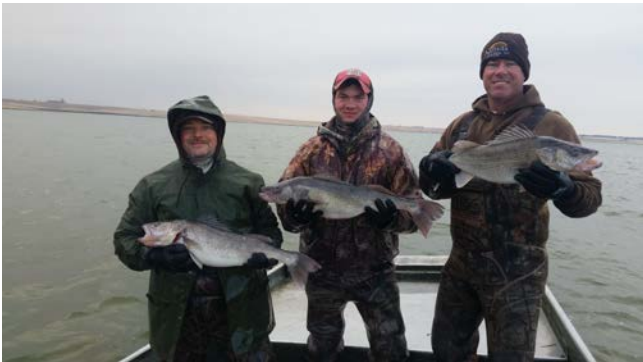
Kirwin Walleye – 2019

WALLEYE - Good. There will be some catch and release this year since individuals in the 8 to 15-inch range accounted for 17.39 percent. However, there will be some nice catches of harvestable walleye - fish in the 15 to 20-inch size range accounted for 71.02 percent, fish in the 20 to 25-inch size range accounted for 11.59 percent of the 2019 fall sample. The density rating at Kirwin (15 inches and above) is 3rd amongst all reservoirs in the state this year. The biggest fish sampled this past year weighed 5.61 pounds. These fish can be caught off the Dam during the spawn in March and April casting jigs, roadrunners or crankbait's. After the spawn would get those night crawlers out and fish the flats and drop offs. A 15-inch length limit is in effect.