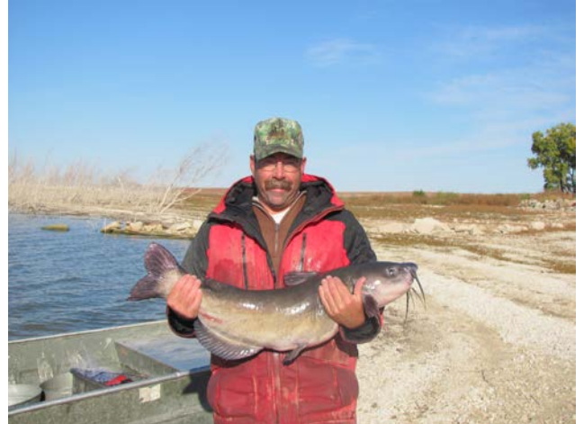
Kirwin 23 lb. Channel catfish - 2012

CHANNEL CATFISH - Good. The overall supply of channel catfish is good as fish were scattered over a wide size range. Fish in the 4 to 11-inch size range accounted for 5 percent, fish in the 11 to 15-inch size range accounted for 40 percent, fish in the 15 to 24-inch size range accounted for 35 percent and fish over 24 inches accounted for 20 percent. The biggest channel catfish sampled in 2019 weighed 8.75 pounds. Flatheads are present in a wide range of sizes with 5 to 50-pound fish being in the population. As the water starts warming up, these fish will be coming up shallow to feed, so fish the upper ends of coves and shallow areas using shad sides and gizzards. Also, the channels should be up in Bow Creek and the North Fork Solomon Rivers. These fish can be caught on rod and reel and/or setlines or trotlines using shad sides and gizzards, shrimp and stink or dip bait.